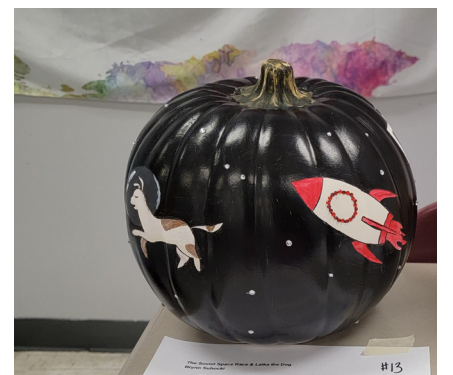
The Soviet Space Race and Laika the Dog by Brynn Suhocki