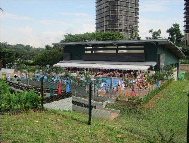
Swimming Pool & Indoor Sports Hall