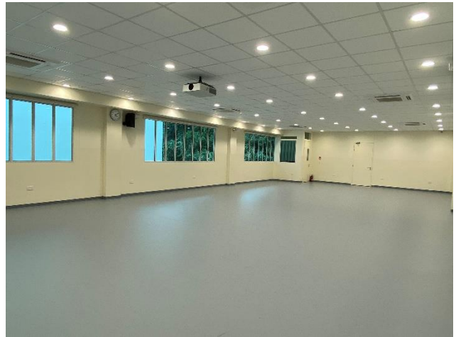
Multi Purpose Hall – Cecilia Hall