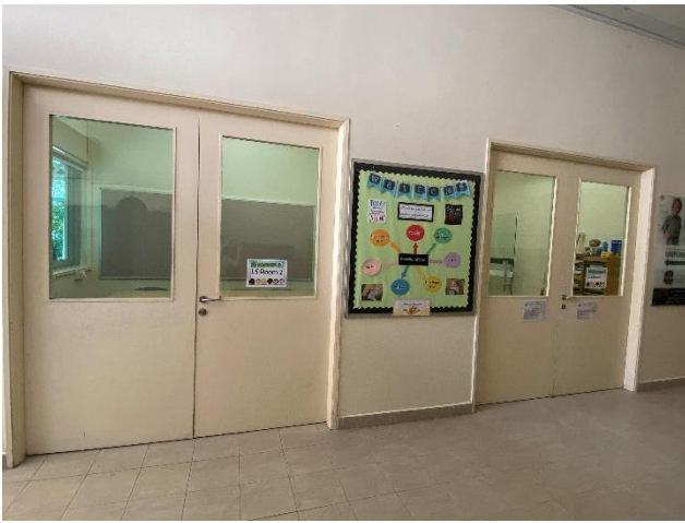
Learning Support Classrooms