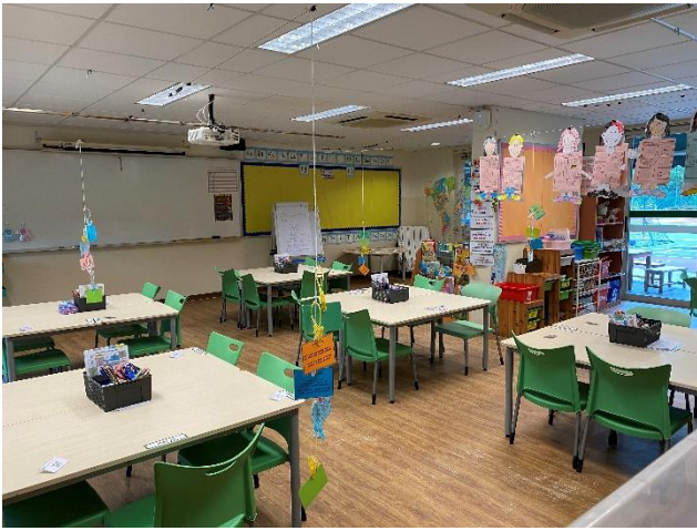
Raphael Block Classroom