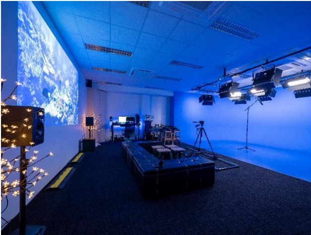
ESTV Room - The Studio