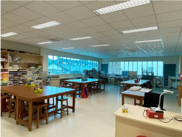
Art Room 1