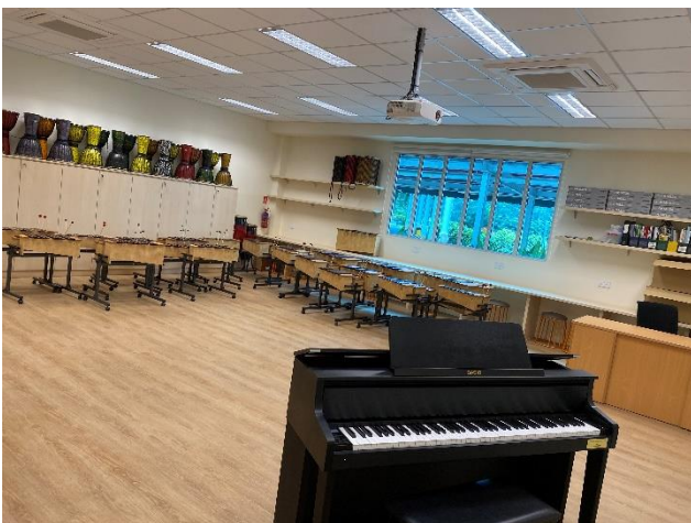
Music Room 1