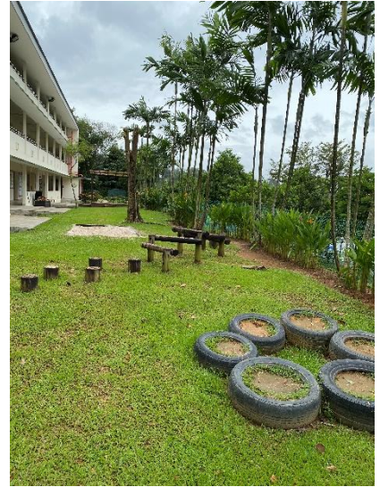
Front of Raphael Block