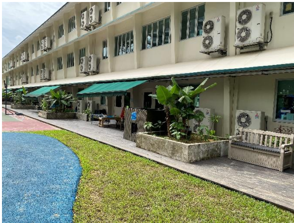
Back of Gabriel Block