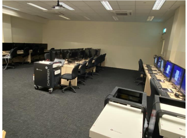
AV Room - Digital Lab