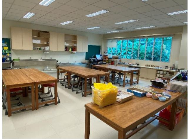
Art Room 2