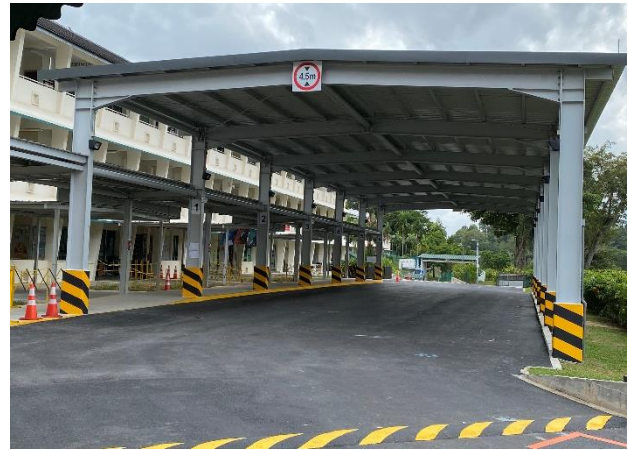
Front of Gabriel Block