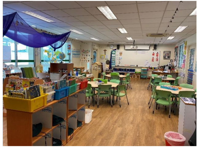
Gabriel Block Classroom