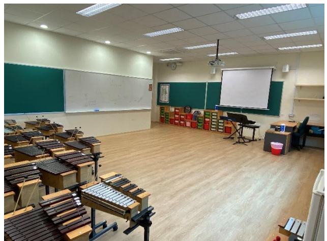
Music Room 2