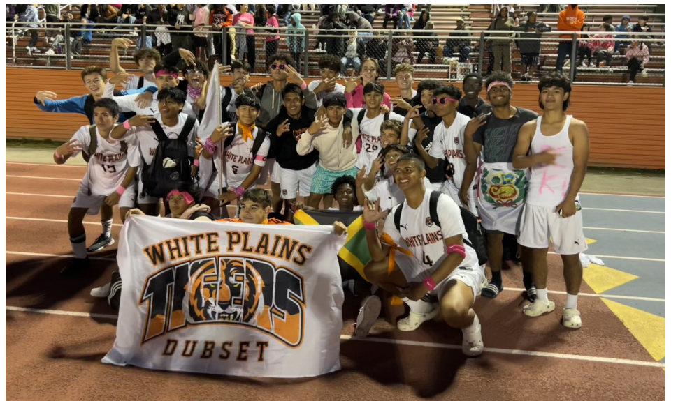
Varsity boys' soccer celebrates after their third consecutive league championship

As the team begins their section run, they are working hard every day to improve and be in top form going into their first match, where they will be facing Carmel on October 22, right here at Loucks Memorial Field. Since White Plains has the home field advantage, they are hoping for a big crowd to help them win their first match and continue to run the gauntlet.