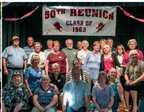
Members of the Class of '69, shown at their reunion, were recognized at commencement.