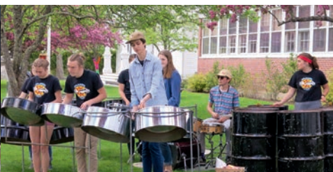
Planet Pan got us dancing in the afternoon.