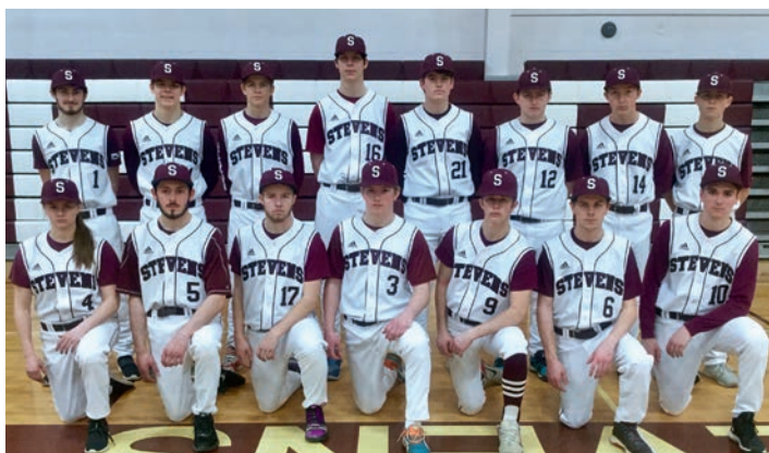
The baseball team