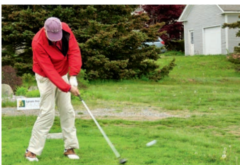
The head of school keeps his head down.

Forty golfers hit the links in the Andy Collier '98 Memorial Golf Tournament at the Castine Golf Club on June 2.