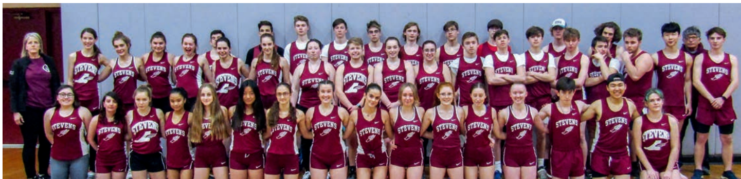
The outdoor track team

Our girls' outdoor track team finished fourth in the Class C PVCs.