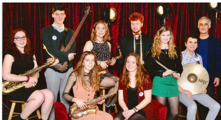
Jam Bake at the state festival.