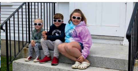
These Eagles' kids each donated!