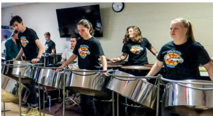
Planet Pan plays at our Spring Concerts.