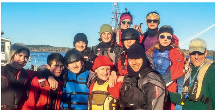
The sailing team