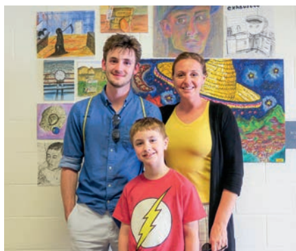
Exhibit Showcases Student Art

Scores of artworks from our visual arts classes and Arts Fest workshops were on display for the annual Student Art Show May 22.