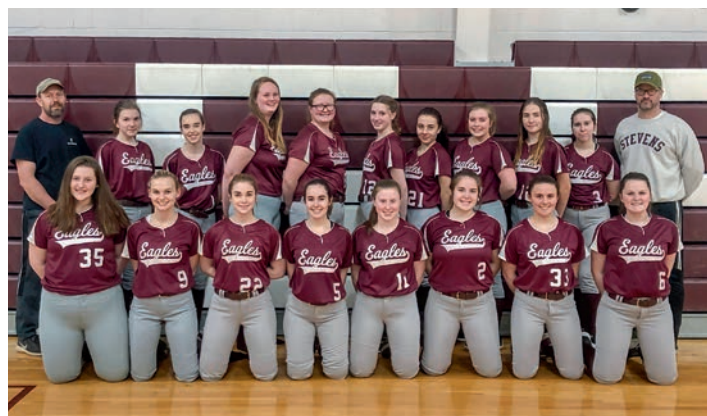
The softball team

Our baseball team finished the regular season in first place with a record of 15-1, advancing to the Class C North semifinals.