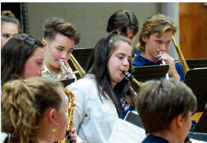
The GSA Band performs.

Sharing our tradition of music excellence through these concerts is just one way GSA enriches the larger community.