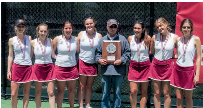
The Northern Maine Class C runners-up