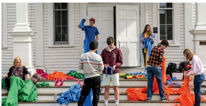
Preparations for Lawn Forest are underway!