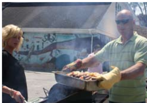
▲ B-day Grill gets cooking at Arts Fest.