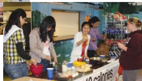
▲ Students make salsa.