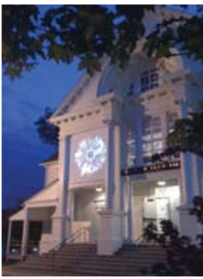
▲ "Clock Project" is projected on the Town Hall.