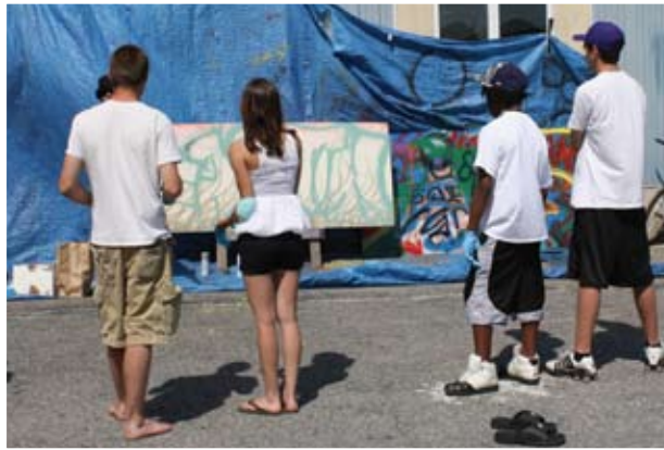
▲ Students take a step back to evaluate graffiti art project.