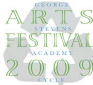
▲ 2009 Arts Fest logo design by Elizabeth Gray '10.

To read more about Fine Arts at GSA and to see class portfolios, visit the Web site at www.georgestevensacademy.org/finearts .