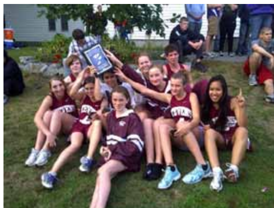
Cross Country team wins Seacoast Invitational