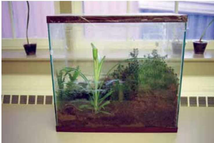
Biosphere, in the Science Projects Room