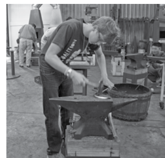
Metalsmithing at Haystack Studio-Based Learning Workshop Fall 2011

So behind the “GSA difference”—those distinctive opportunities our students have, whether Independent Study programs, the yearly Arts Festival, mentorships with local artists and businesses, alternative course contracts, and dozens of elective courses—lies another difference: the difference between the tuition we receive and the dollars it costs to support our distinctive curriculum and programs.