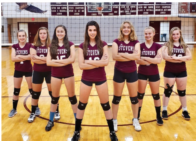
Our girls' varsity volleyball team

Our volleyball team finished the season in second place with a regular-season record of 13-3, advancing to the Class C State semifinals.