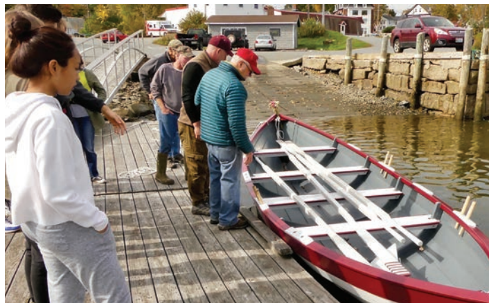
Students look on as Eagle 1 is inspected for leaks. The only liquid found inside was apple cider, no longer sparkling.