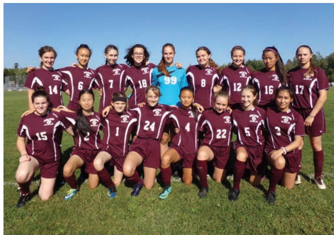
Our girls' varsity soccer team