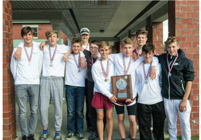
Our boys' varsity cross-country team after the Class C North meet