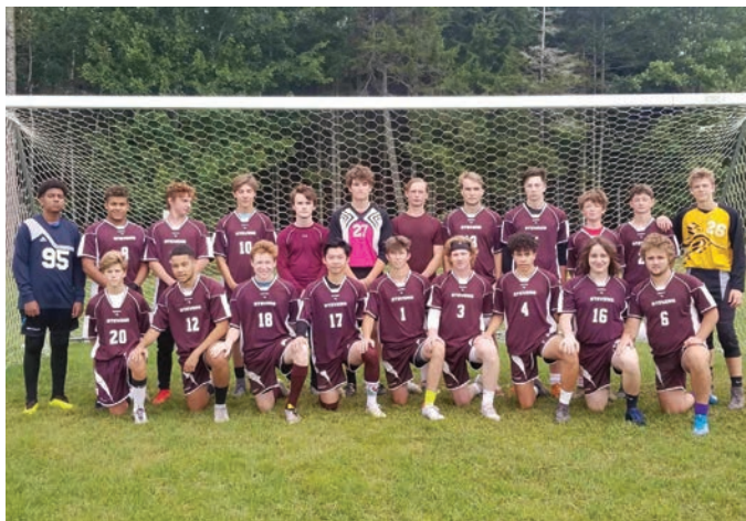
Our boys' varsity soccer team

Our boys' varsity soccer team finished the regular season in fourth place and took home the Class C North runners-up plaque.