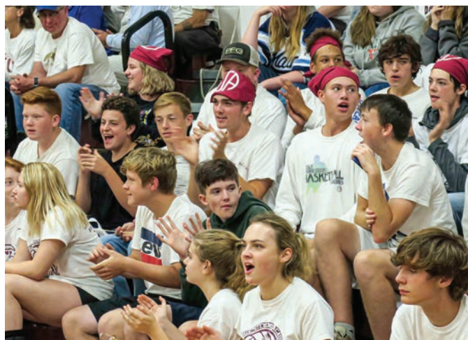
Fans cheer during the volleyball White Out Night.