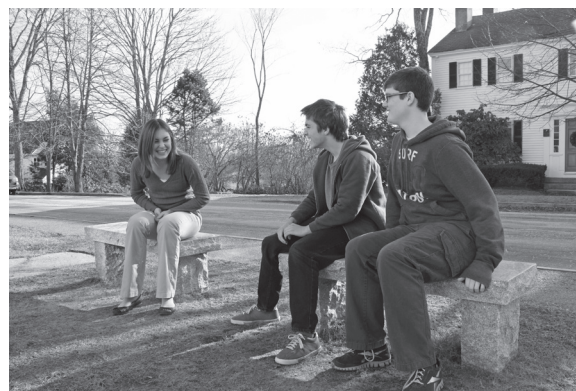
The Class of 2012 made a gift of two beautiful granite benches that grace the front lawn. Thank you!

THANK YOU, CLASS AGENTS, FOR YOUR LEADERSHIP AND SUPPORT!