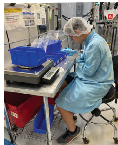
The student image is from a 2021 internship at MME Group, a Vadnais Heights-based full-service manufacturer.