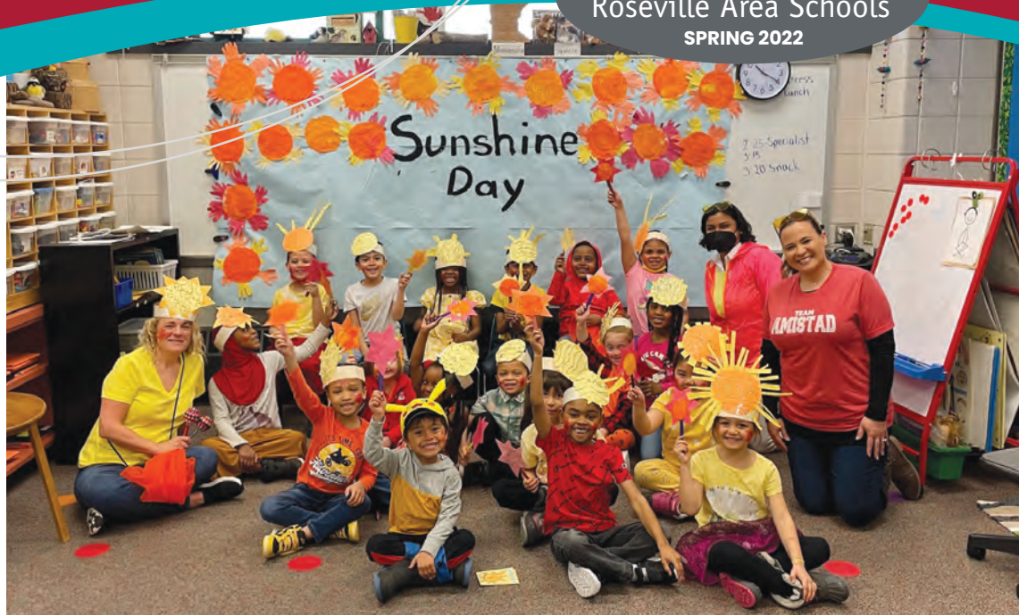
In April, Harambee Elementary School hosted a series of theme days to celebrate school unity, class pride, and creativity. On Sunshine Day, students were encouraged to wear yellow, orange, or white and teachers incorporated “sunshine” into their teaching. In one 2nd grade classroom, students learned about earth revolutions and orbits.

The best way to determine our path forward is to engage with the people who are directly impacted – students, staff, families, and community members. We hope you will join us! We will post information about ways you can be involved in this very important process on our district website ( www.isd623.org ) and our district social media (@isd623 on Facebook/@rosevilleareaschools on Instagram).