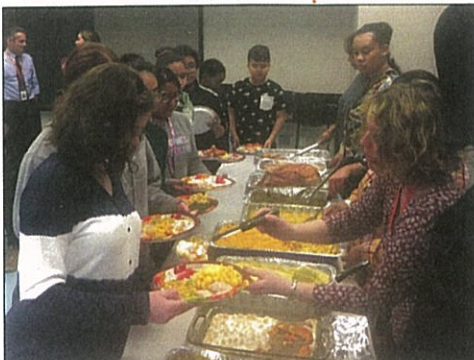
Participants in the Highlands Mentor Program enjoy a pot-luck Thanksgiving feast.

you feel you can always go to or talk to can change a child’s life. ” Early results are promising — among the mentees, attendance is rising and grades and behavior are improving.