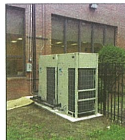
New AC unit outside GW (above)