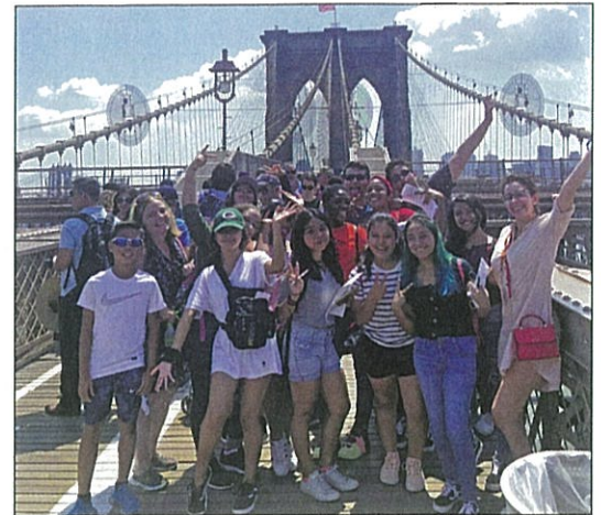
The ENL Summer Experience included the Museum of Natural History, Ellis Island, the Brooklyn Bridge, and more.