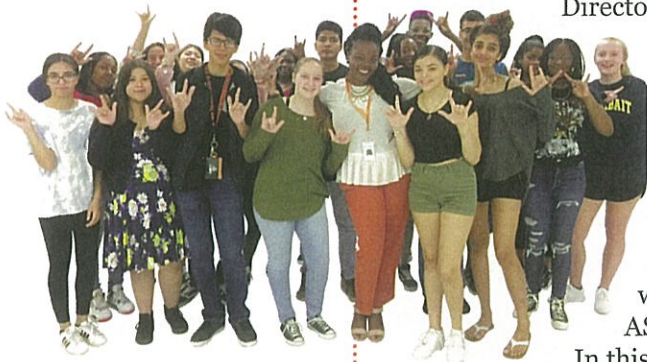
Students in the American Sign Language class.