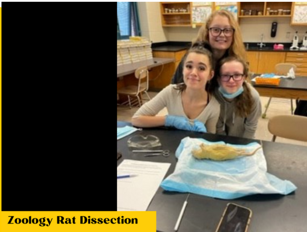
Zoology Rat Dissection