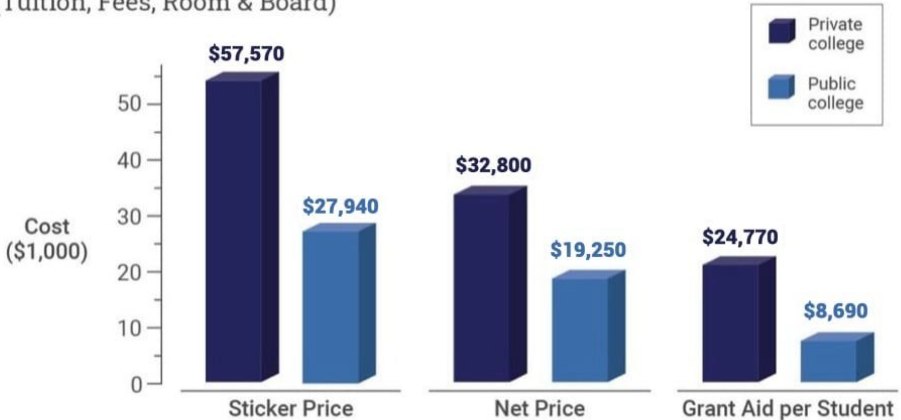
Average Sticker Price vs. Average Net Price (Tuition, Fees, Room & Board)