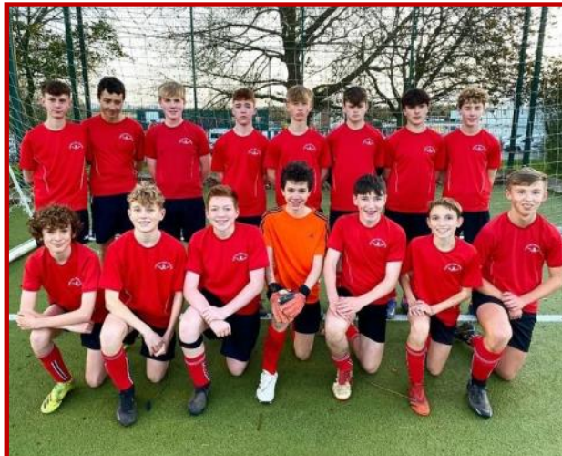
On Tuesday 8th November our Year 10 football team played against Studley High School. The final score was 2-1 to Studley.