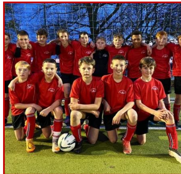
Wednesday 28th September saw our Year 7 team play Alcester Academy. The final score was 1-1.