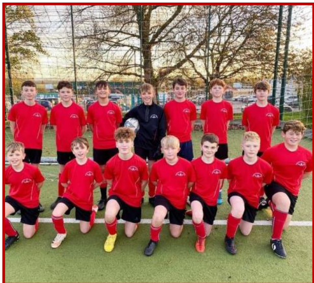
Well done to our Year 8 football team who won 6-1 against Alcester Academy on Wednesday 9th November.