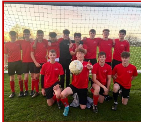
Our Year 11 football team played Southam College on Wednesday 9th November and came away with a 1-1 draw.