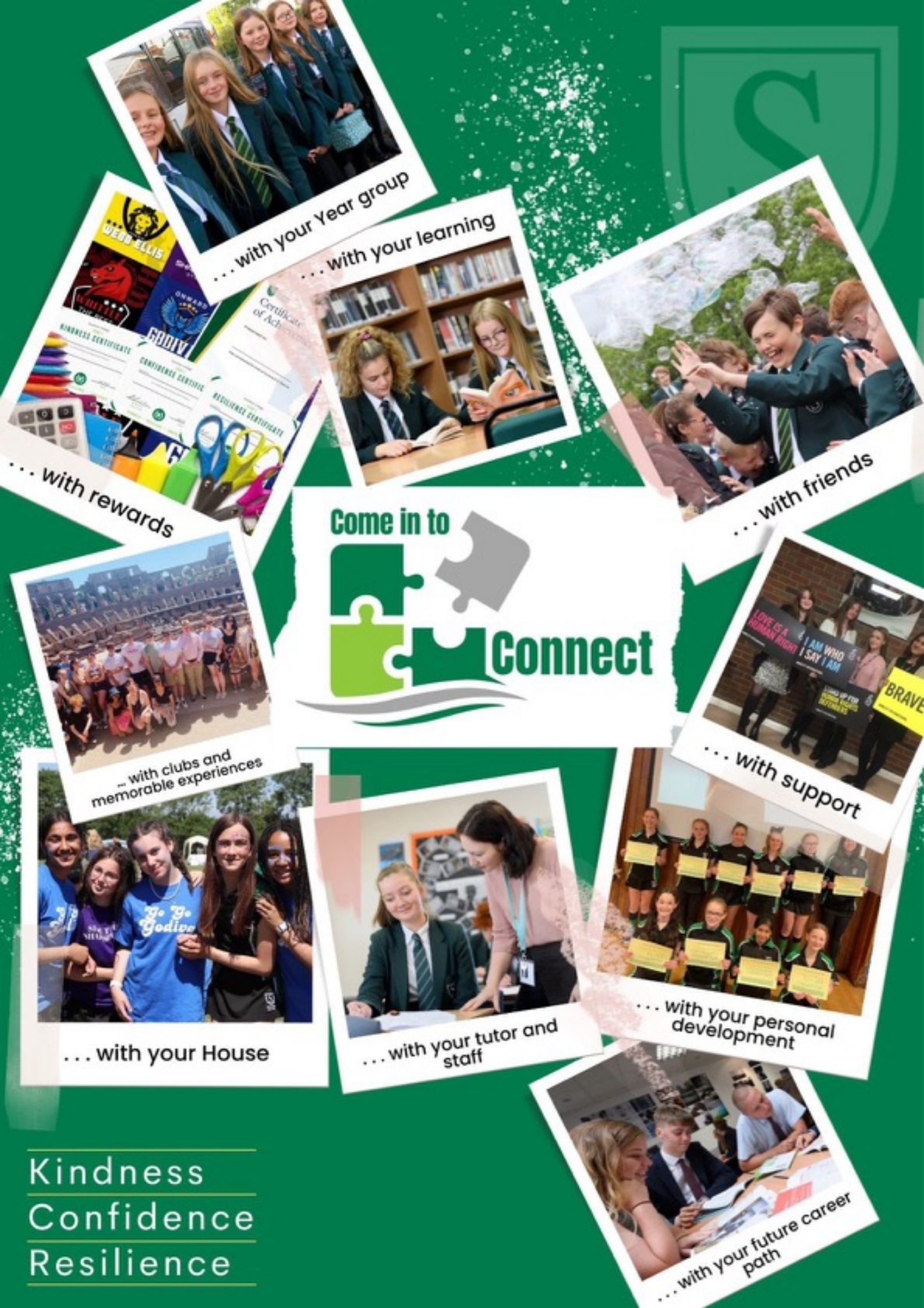
... with your Year group