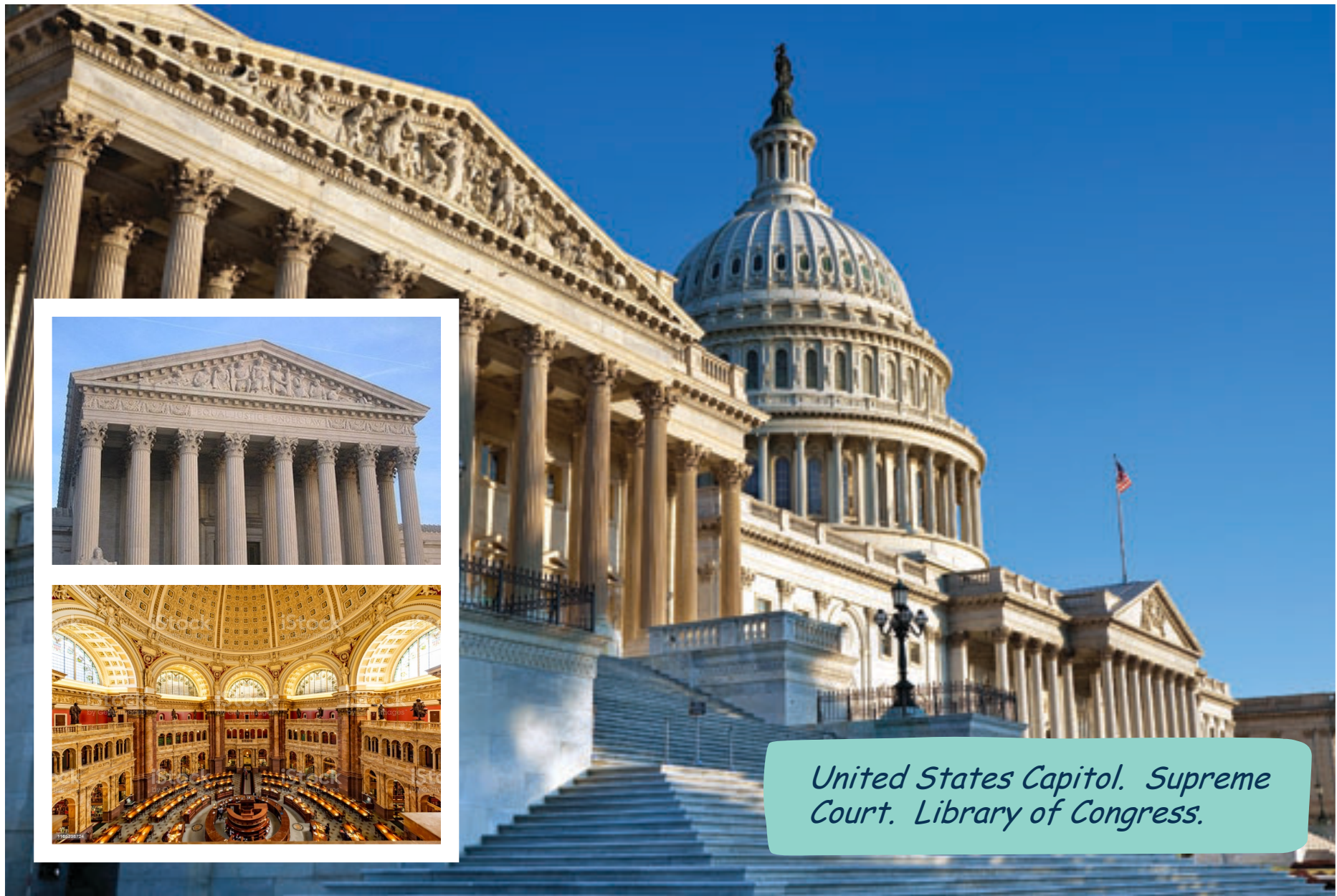
United States Capitol. Supreme Court. Library of Congress.