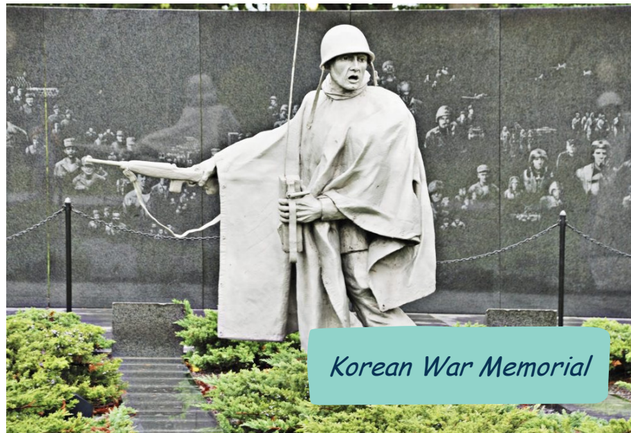
Korean War Memorial