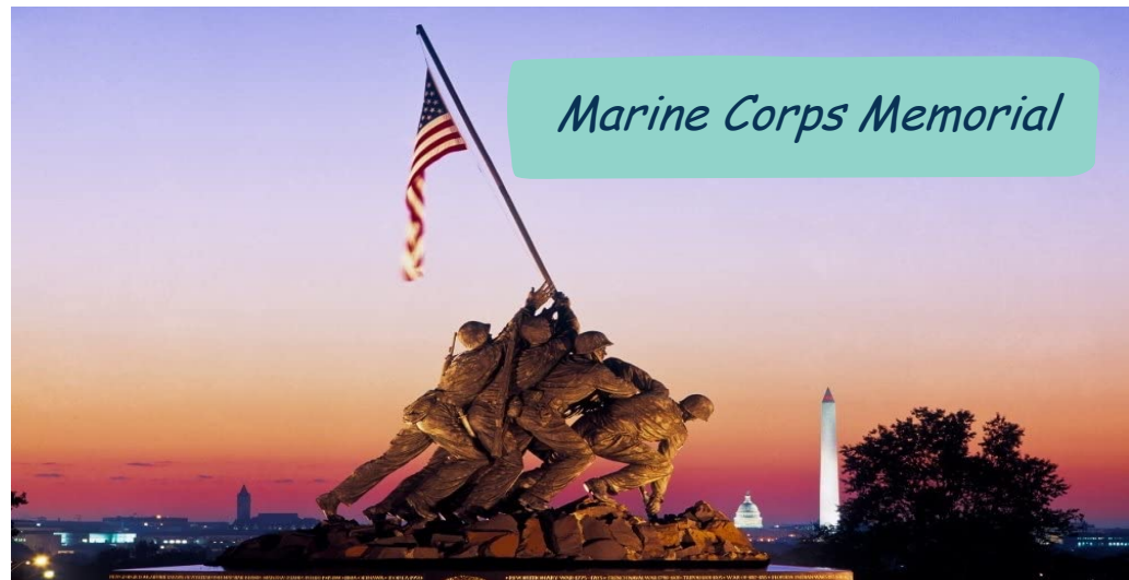
Marine Corps Memorial