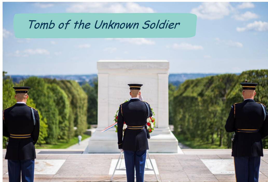
Tomb of the Unknown Soldier