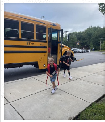
FIRST DAY OF SCHOOL