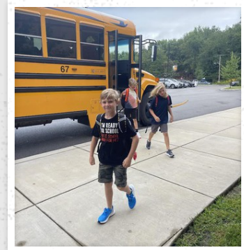
FIRST DAY OF SCHOOL