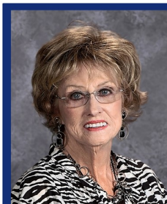
In Memory of Diane Dietiker Educator's Award