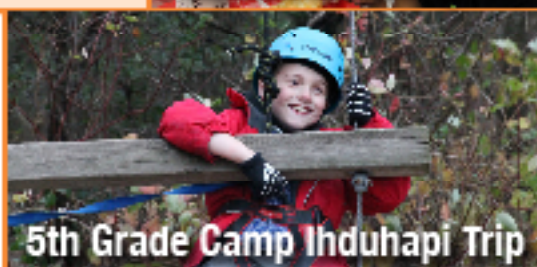
5th Grade Camp Induhapi Trip

Kids Place location for before and after school child care