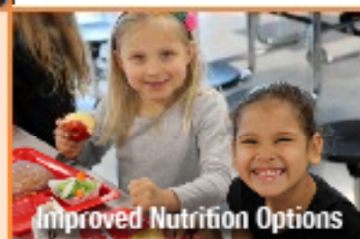
Improved Nutrition Options

2 Days Per Week: • Spanish Instruction • Music Instruction