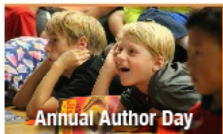
Annual Author Day

2 Days Per Week: • Spanish Instruction • Music Instruction