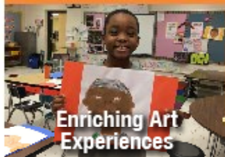
Enriching Art Experiences