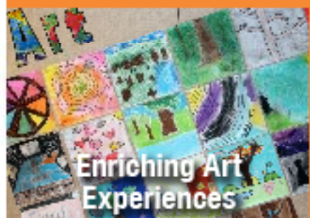
Enriching Art Experiences

Social, emotional, and mental health services available to all students