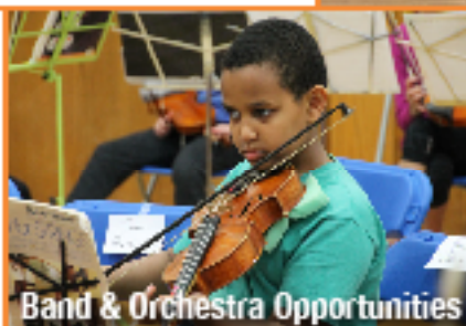
Band & Orchestra Opportunities

White: 43.5% Black/African American: 28.3% Hispanic/Latino: 11.5% Two or More Races: 11.5% Asian: 4.8% American Indian/Alaska Native: 0.4%