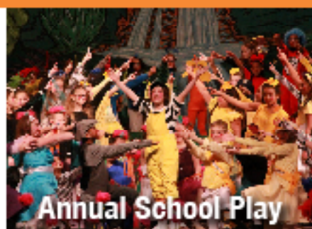
Annual School Play