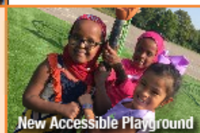
New Accessible Playground