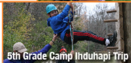
5th Grade Camp Induhapi Trip

Kids Place location for before and after school child care