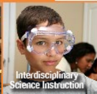
Interdisciplinary Science Instruction

Social, emotional, and mental health services available to all students