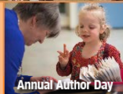
Annual Author Day

Social, emotional, and mental health services available to all students