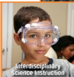
Interdisciplinary Science Instruction

Social, emotional, and mental health services available to all students