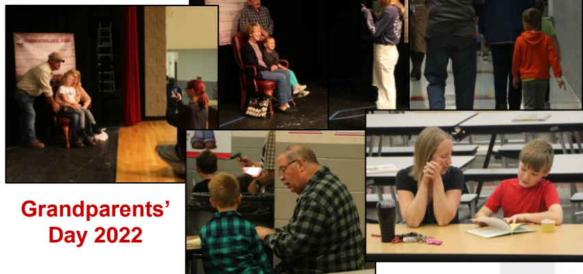
Grandparents' Day 2022