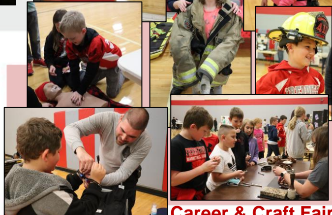
Career & Craft Fair