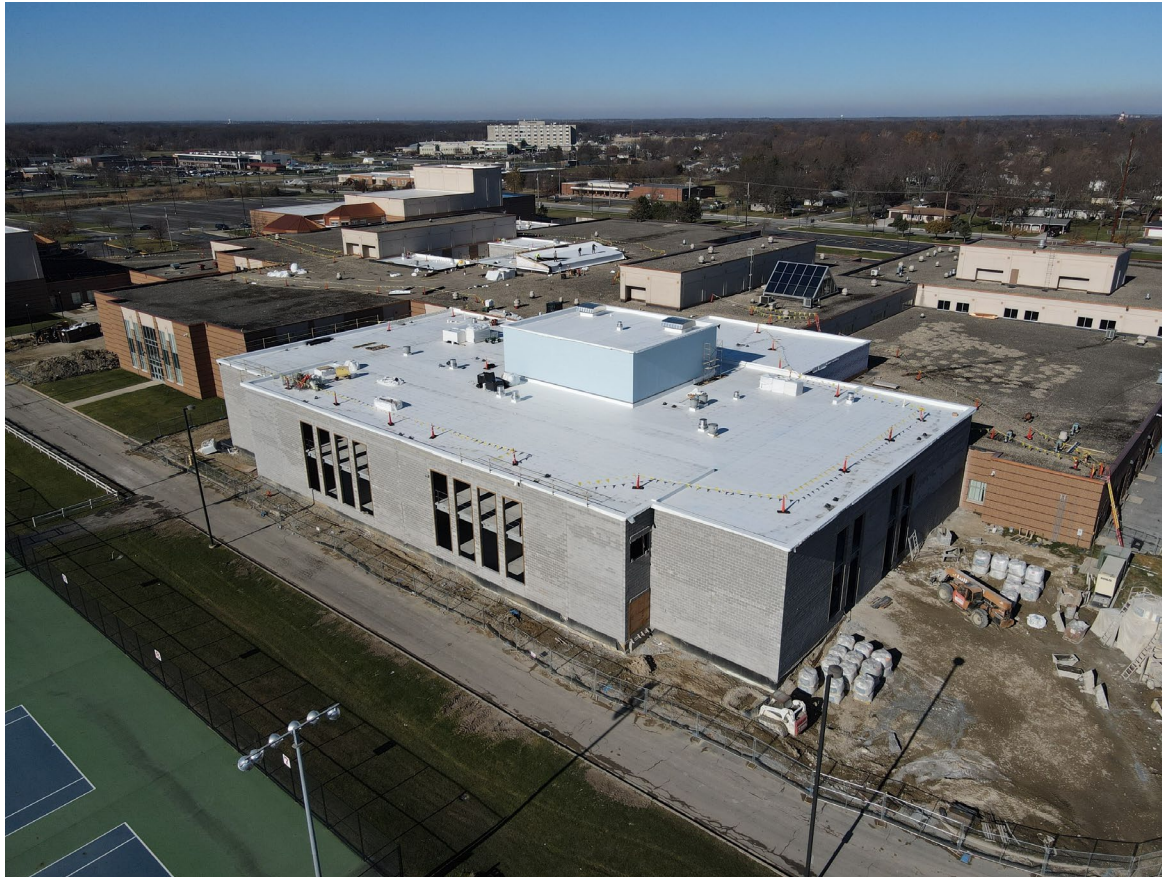
Classroom Addition Roofing