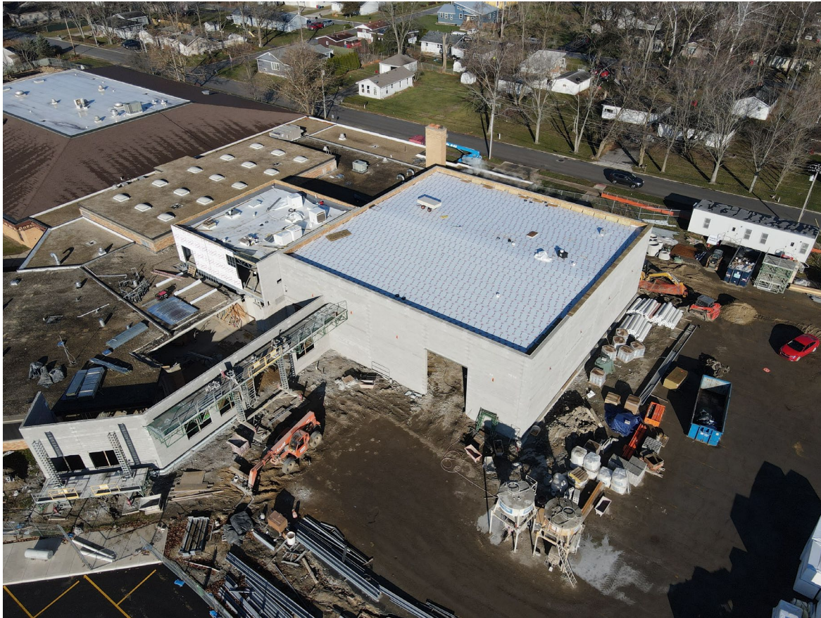
Gymnasium Addition CMU Walls