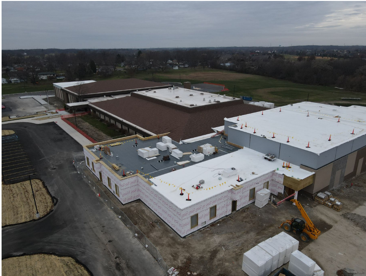
Pre-K Addition Exterior Walls