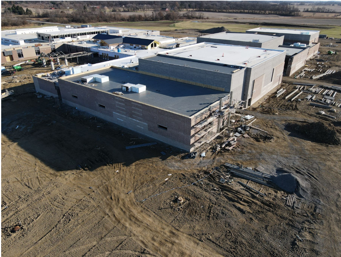
Auditorium and Performing Arts CMU Walls and Facebrick