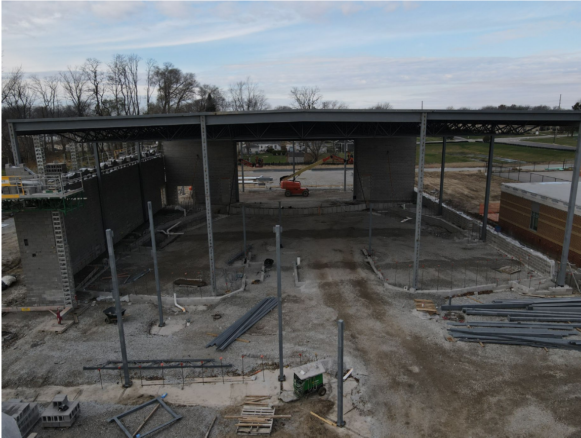
Auditorium Addition Structural Steel