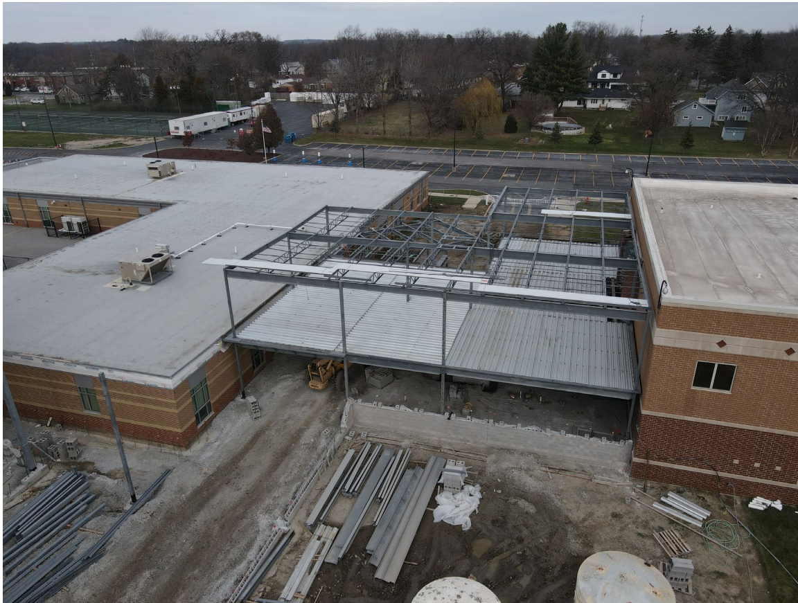
Classroom Addition Footings