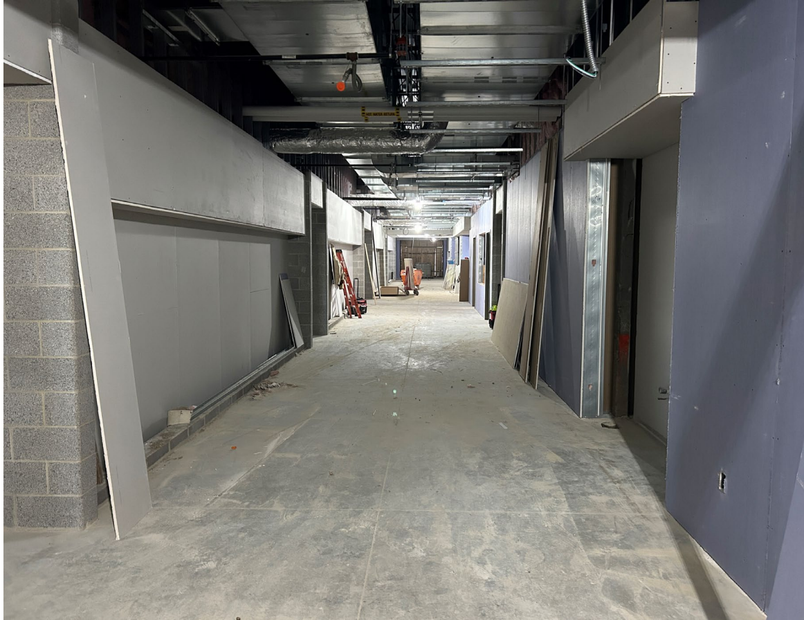
Academic Wing Drywall