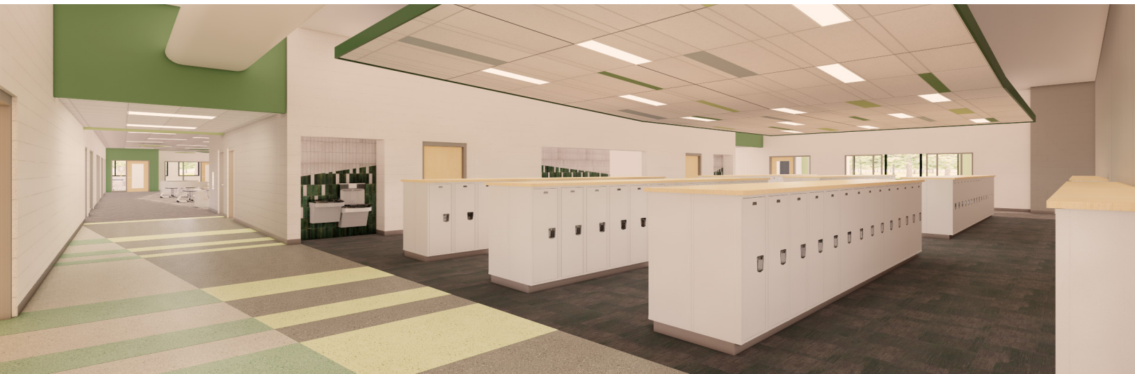
NEW ELEMENTARY SCHOOL RENDERED LOCKER BAY AT CLASSROOM CORE

In addition to the work at Vel Phillips Middle School and the new elementary school, OASD met with all four principals in the last week of September to finalize designs for the secure entry projects at Read ES, Oakwood ES, North HS, and West HS. These projects remain on track to go out to bid at the end of the calendar year, with construction targeted to start between March and June of 2023.