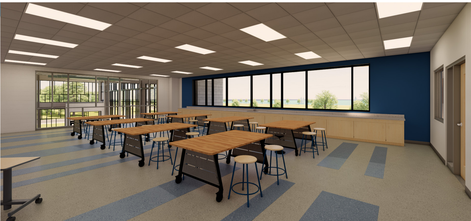
NEW ELEMENTARY SCHOOL RENDERED MAKERS SPACE ADJACENT TO CAFETERIA