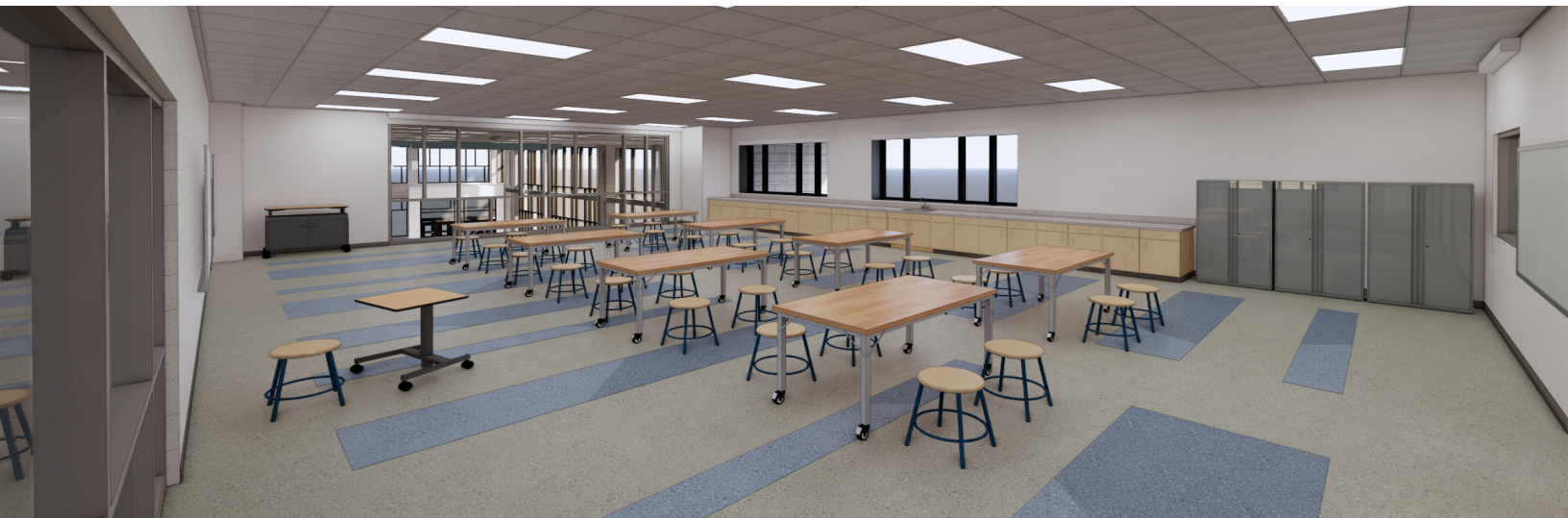
NEW ELEMENTARY SCHOOL RENDERED MAKERSPACE

The OASD has released an initial survey for the New Elementary School, asking for suggestions on what to name the building. This survey will be the first of two to gather information. The School Board will consider the survey results when deciding on the name of the new building. The first survey will close on November 7th. You can access the survey on the school district's website to submit your suggestions.