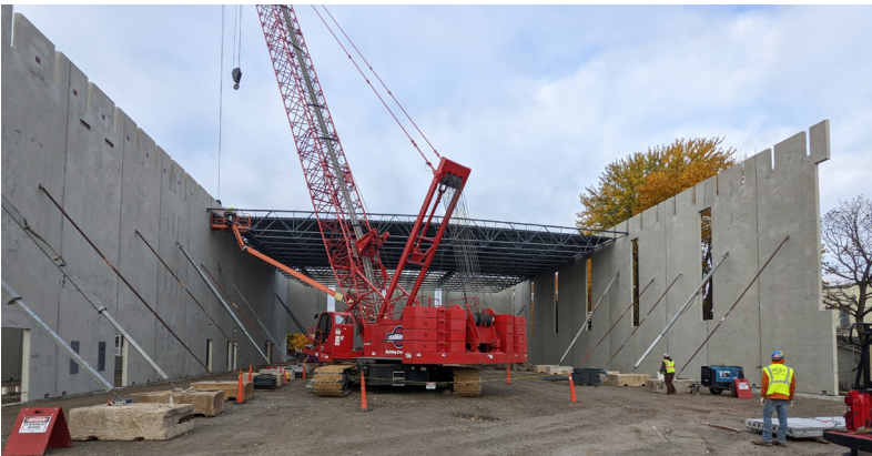
CRANE AT VEL PHILLIPS FIELD HOUSE SETTING WALL PANELS