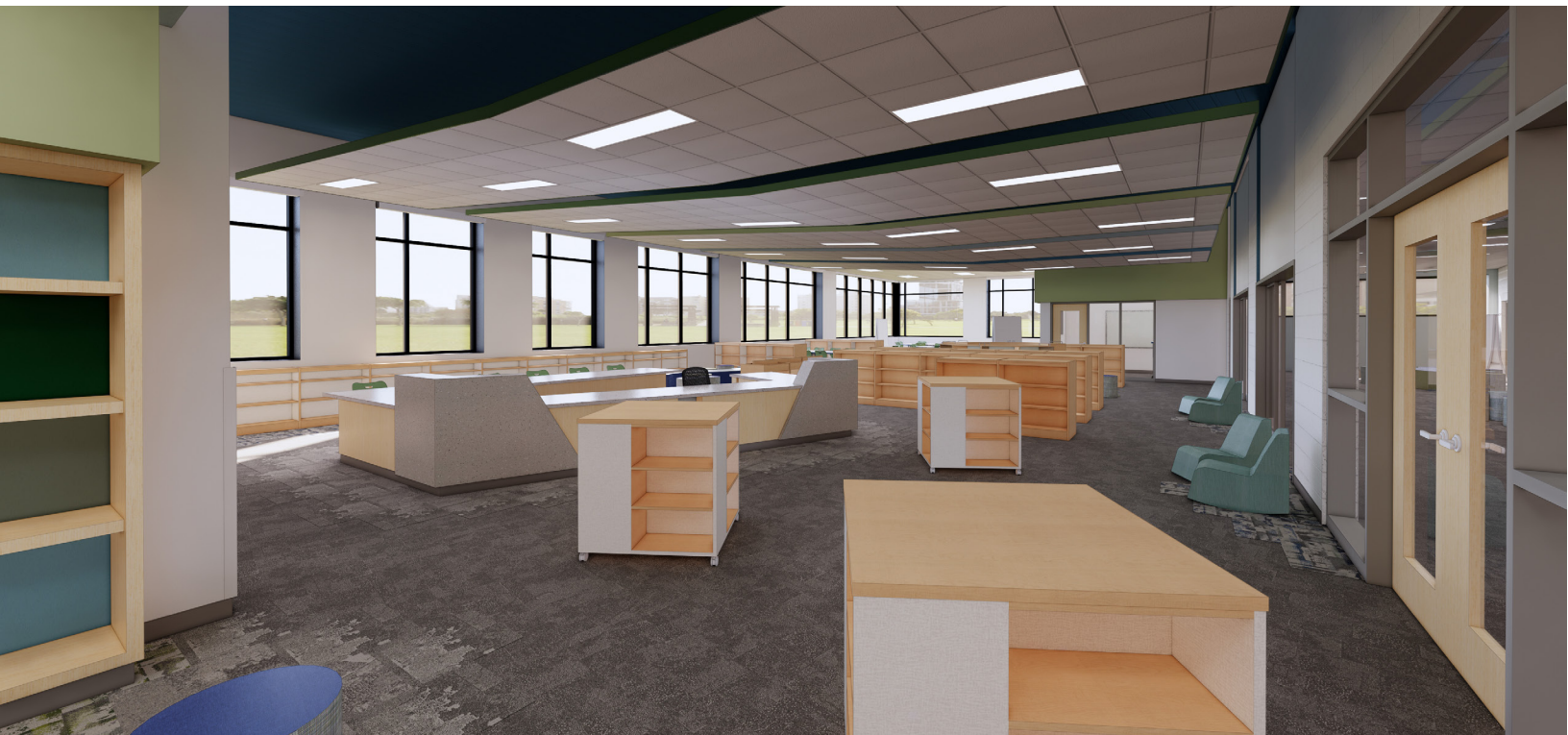
NEW ELEMENTARY SCHOOL RENDERED MEDIA CENTER