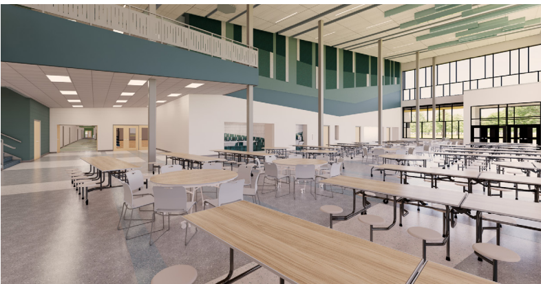
NEW ELEMENTARY SCHOOL RENDERED CAFETERIA