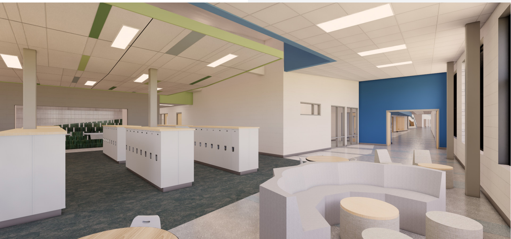
NEW ELEMENTARY SCHOOL RENDERED KINDERGARTEN / FIRST GRADE