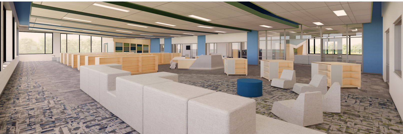
NEW ELEMENTARY SCHOOL RENDERED MEDIA CENTER

A quick update on the Secure Entry projects waiting to be completed at North HS, West HS, Oakwood ES, and Read ES. As you might remember, the bid market was not friendly to the school district last January, resulting in one bid, mainly over budget. However, everything is on track to go back to bid with a revised scope of work this upcoming December. The school district will receive bids in January and have the results of these projects and the New ES project all in the same window.