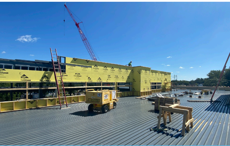
WINDOW FRAMING ABOVE CAFETERIA AT VEL PHILLIPS