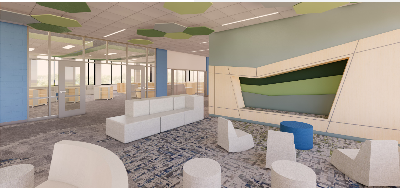
NEW ELEMENTARY SCHOOL RENDERED COLLABORATION AREA OUTSIDE OF MEDIA CENTER