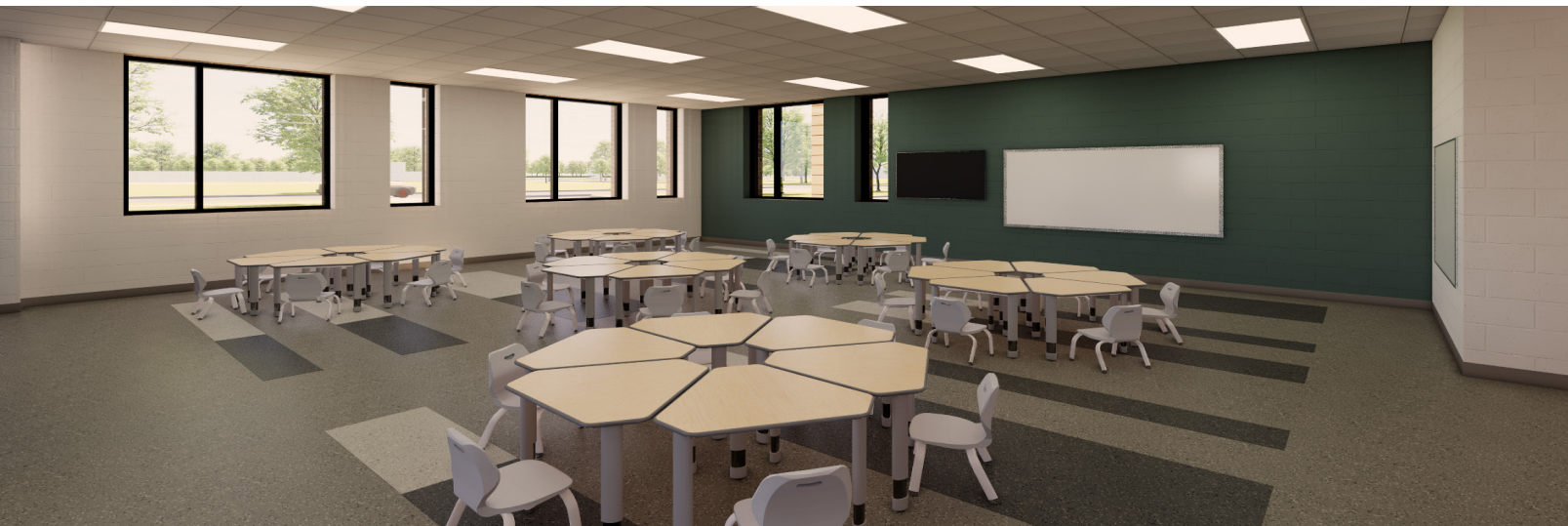
NEW ELEMENTARY SCHOOL RENDERED COMMUNITY ROOM