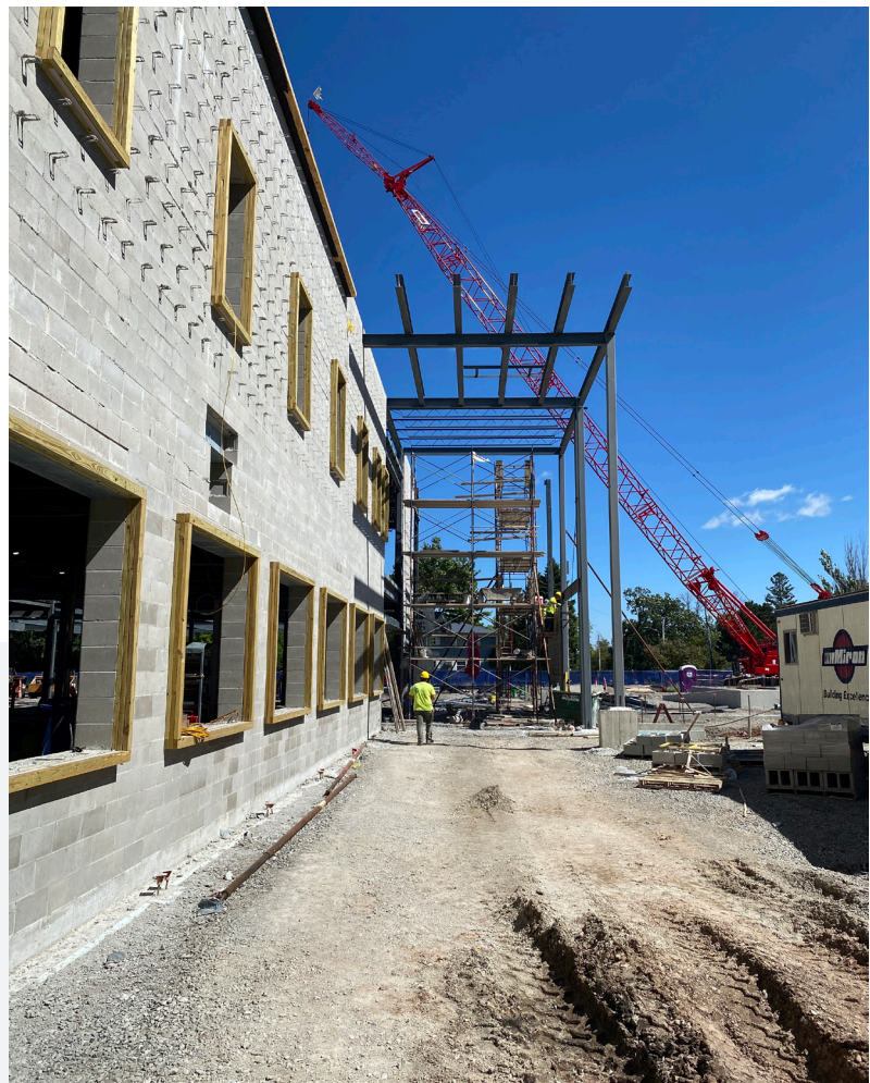
VEL PHILLIPS MIDDLE SCHOOL ENTRANCE FACING JACKSON ST