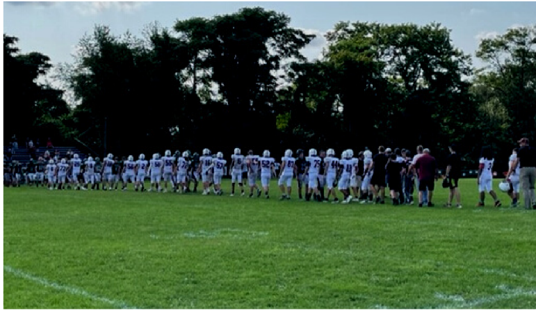
The football team away at Holy Cross after their first win of the season