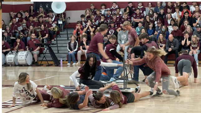
Senior athletes competed to roll a table over top themselves across the gymnasium floor, with the girl's team triumphing.