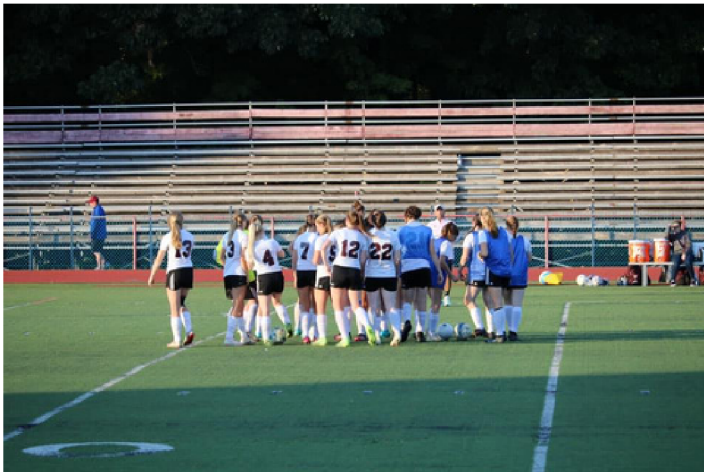
Picture of the Varsity Girls Soccer team together in a huddle