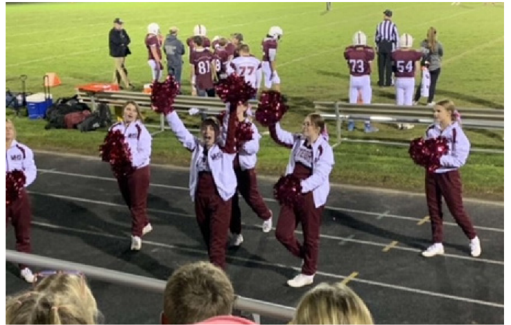
The cheer team at the pink-out game

The wait for next season is already heavily anticipated, and many can't wait to showcase what they've got.