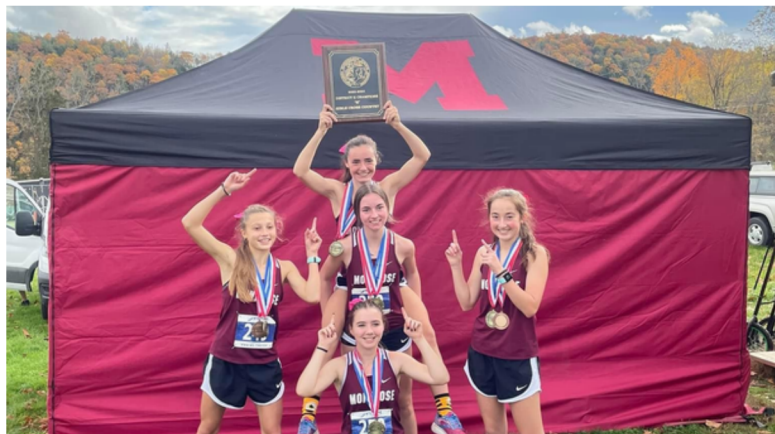
Girl's Cross Country: Winner Of The District Title