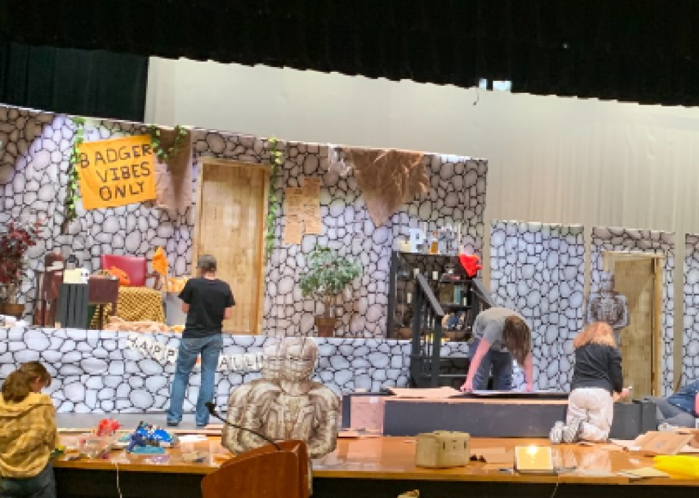
The theatre company working on the set.