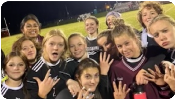
Girls soccer after a game celebrating winning the district title.