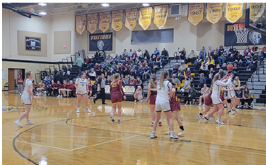
Varsity girls basketball beat Junction City at home.