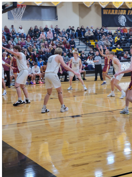
Varsity boys basketball defeated Junction City at home.