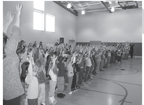
Pictured at Right is the Reach Out and Dance warm up "Make the Pizza".