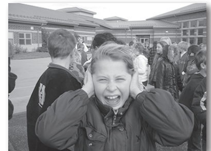
Third grade students participated in the "Great American Scream-Out" to commemorate the Great American Smoke-out on November 17, 2011. Students "screamed" after recess because they have healthy lungs and don't smoke.