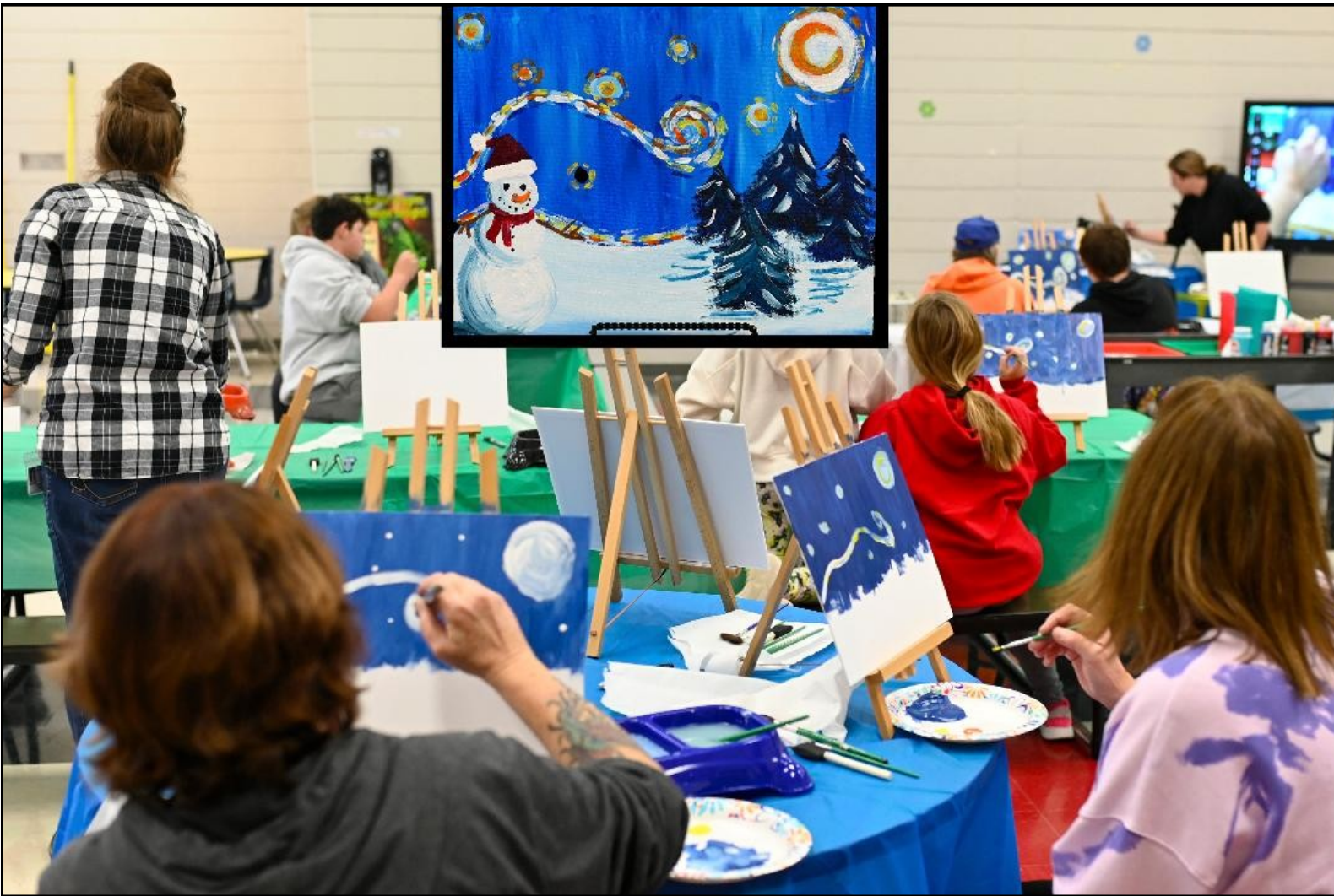
Pictured: Festivalgoers try their hand at painting.

It was a success and they are already planning for next year. The Senn-Thomas Fall Festival took place the Saturday before Thanksgiving with a gym full of games and vendors. The band room became a gaming room. Two classrooms showed movies, and popcorn was available to everyone. Board games were spread throughout the library, including a giant Jenga tower and a waist-high Connect Four. There were so many activities they handed out maps at the entrance.