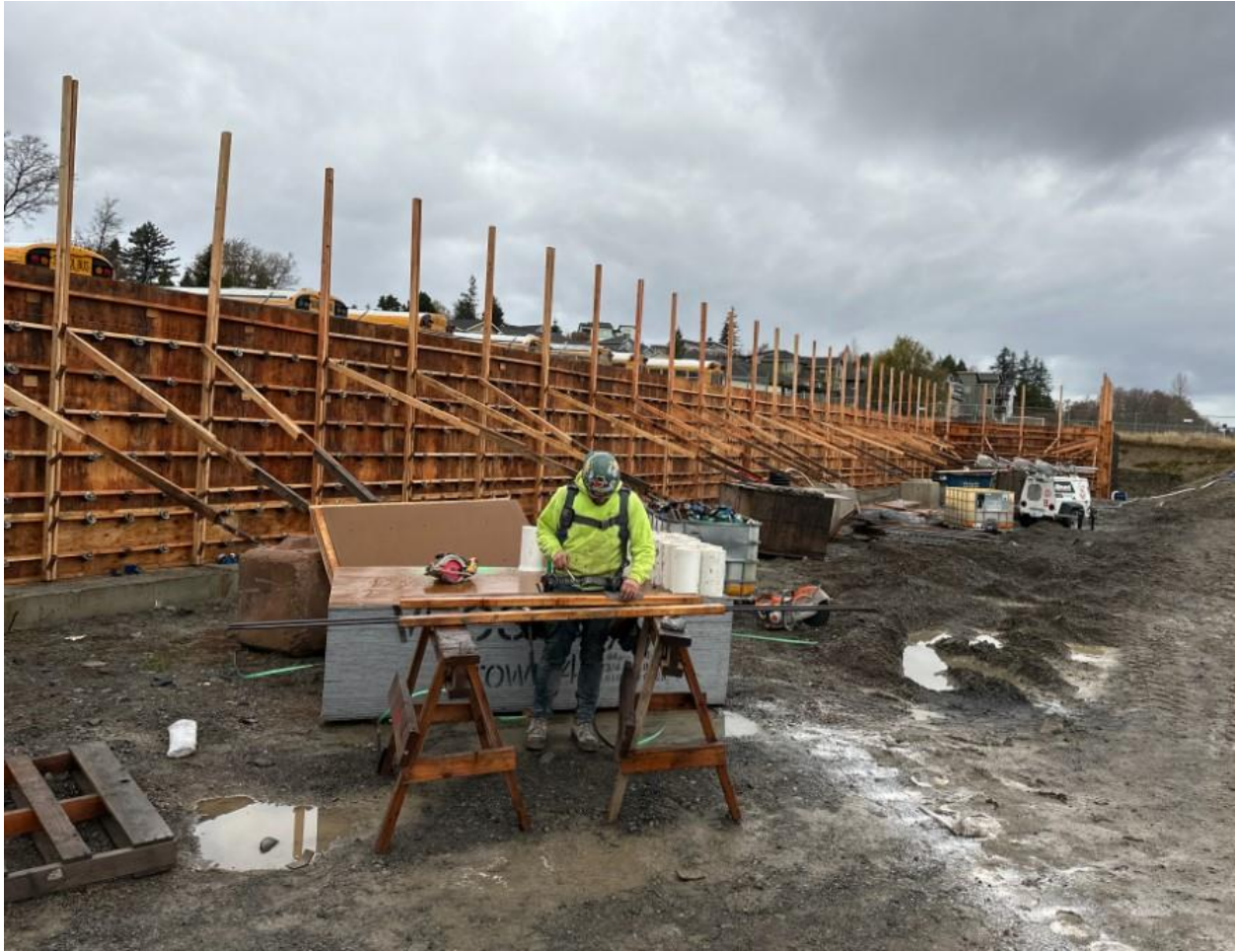
Retaining wall formwork around the long jump area