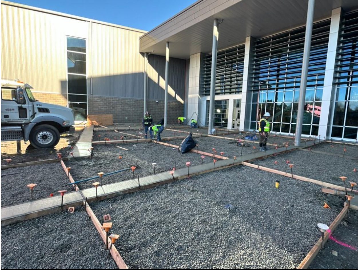
Concrete sidewalks being poured in the commons courtyard