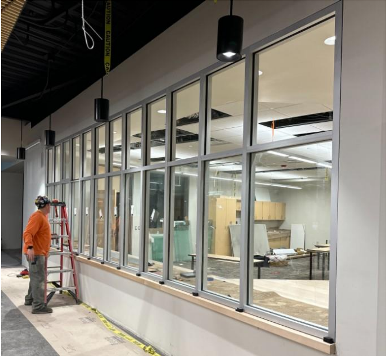
The display between the marketing classroom and the Commons Area