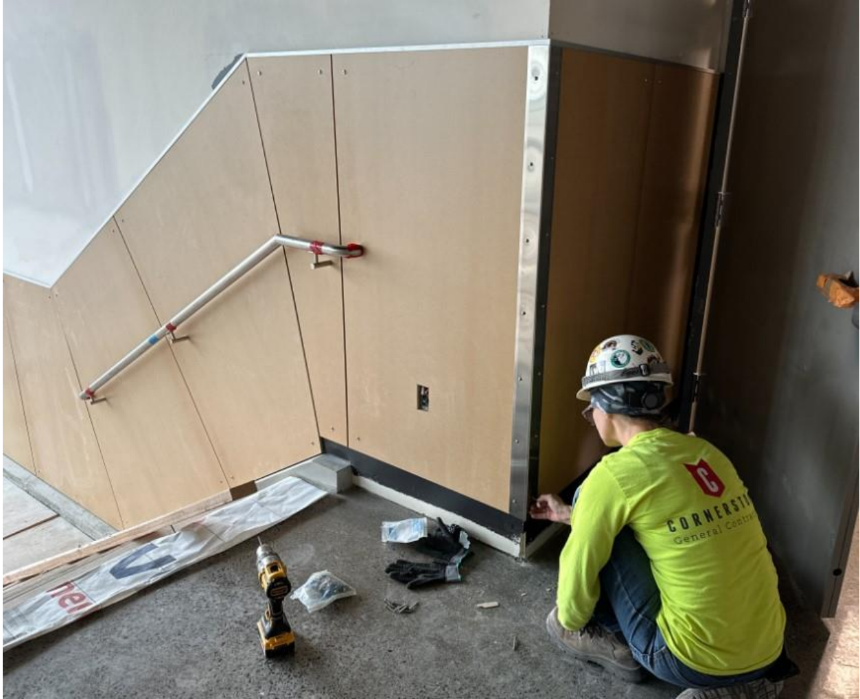
Wall coverings and guard rail installation in the Academic Wing stairwells