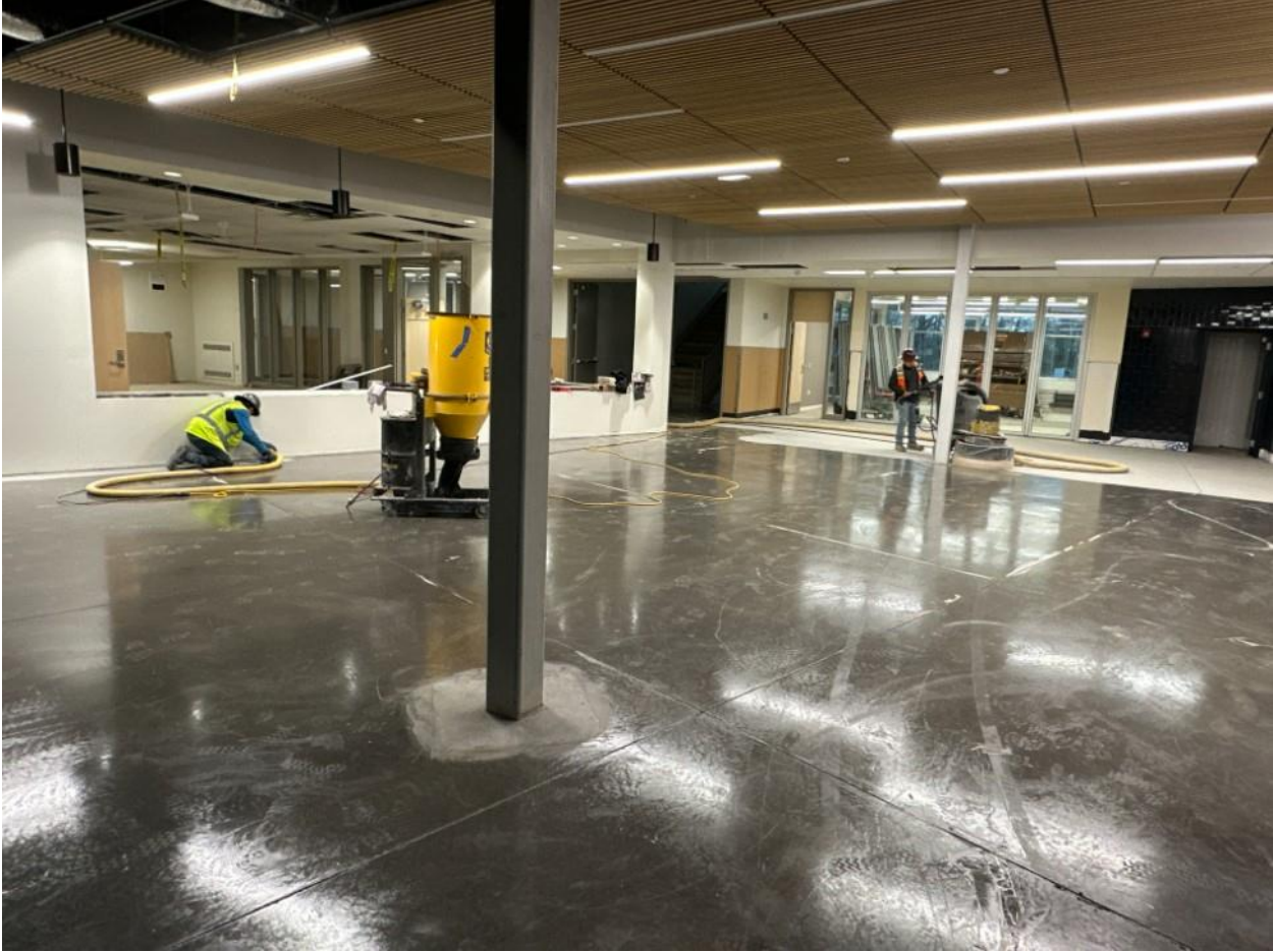
Grinding and polishing of the concrete floors in the Commons Area