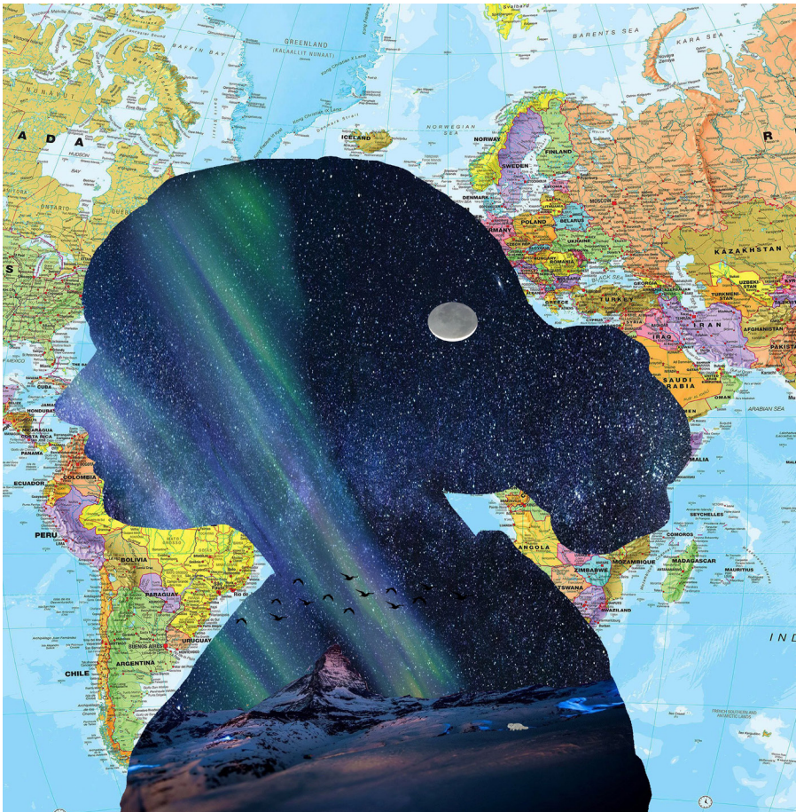
By: Nur K.