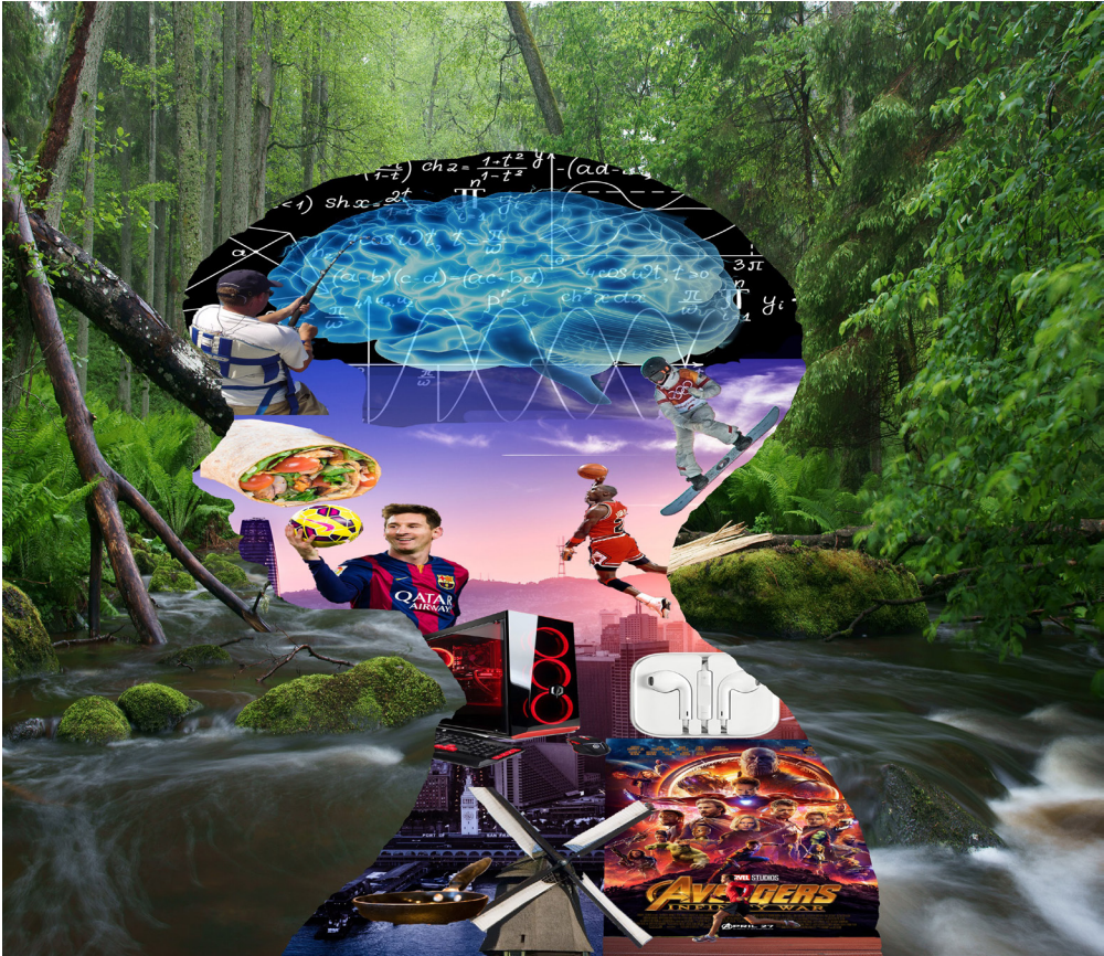
By: Damien K.

Good Players INSPIRE THEMSELVES, Great Players INSPIRE OTHERS