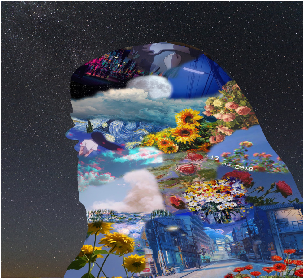
By: Alissa G.

Digital Art 8 students created their first collage in Photoshop CC that represented their individual interests and personalities. Students mastered the use of layers and the eraser tool in Photoshop which is demonstrated through their high quality craftsmanship. Students also used different principles of art such as unity and contrast, to create a sense of harmony and visual interest.