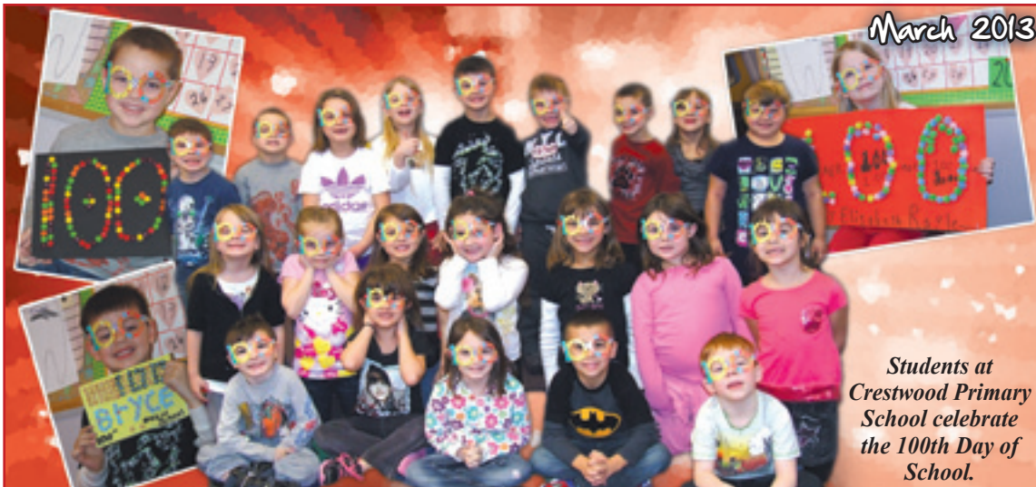
Students at Crestwood Primary School celebrate the 100th Day of School.

Crestwood classrooms received a stock-up on necessary classroom supplies like construction paper, folders, tissue, paper towels, and disinfectant wipes thanks to the generosity of Walmart in Bainbridge. Walmart's Teacher Rewards Program is intended to help teachers keep their classrooms stocked with supplies. The program has been in place nationwide for four years. This program allows each local store to choose one local school district to award $1,000 in gift cards. This year the Bainbridge store chose Crestwood Schools.