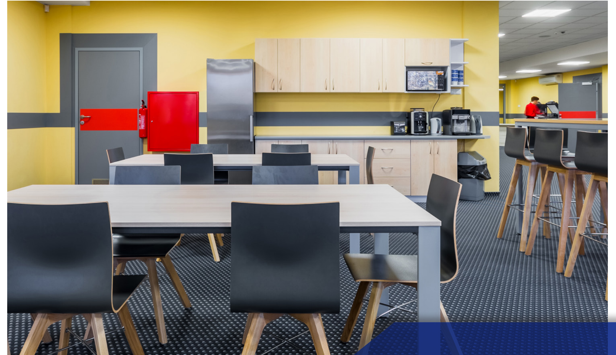
FACULTY LOUNGE NEW HIGH SCHOOL $200,000