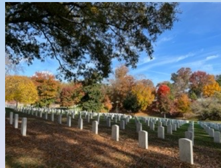
Arlington National Cemetery