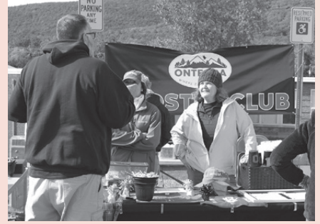
The Onteora Booster Club welcomes community donations.

Onteora welcomes the support of our school community. Parents and community members share their time, labor, and/or expertise in many ways, including by joining parent teacher organizations, volunteering in classrooms, and pitching in on school projects. Some people have asked how they can support our students in other ways, including financially. Following is information on community donations: