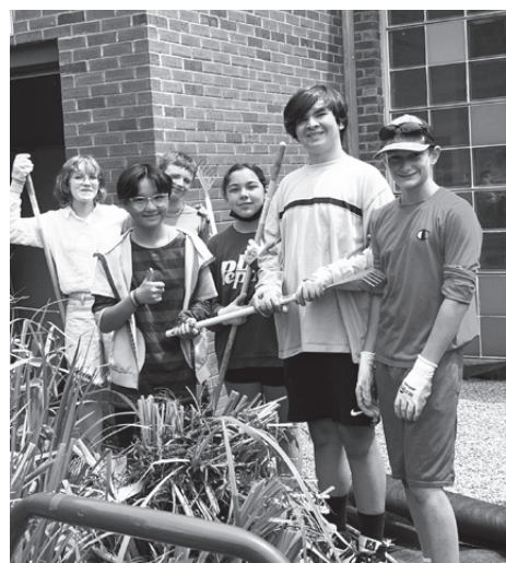
These former Bennett students were among the many volunteers who transformed their school's courtyard.