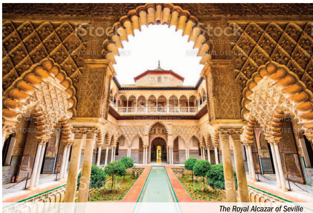
The Royal Alcazar of Seville

After breakfast aboard, disembark and transfer to the airport for flights homeward. (B)