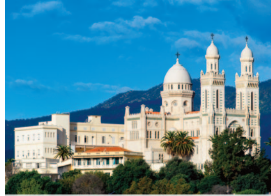
Basilica of Saint Augustin, Annaba, Algeria