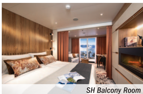
SH Balcony Room