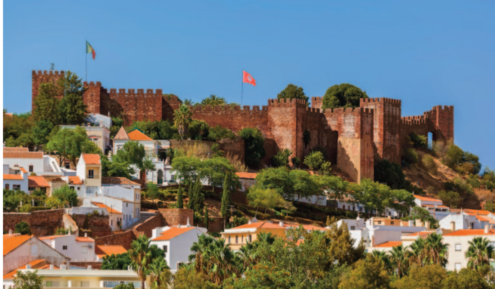
Portugal's attractive town of Silves is dominated by its castle