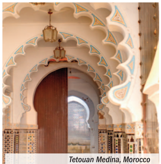
Tetouan Medina, Morocco