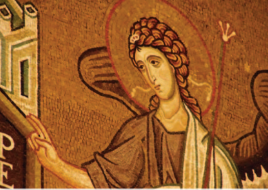
Detail of mosaic in Capella Palatina, Palermo