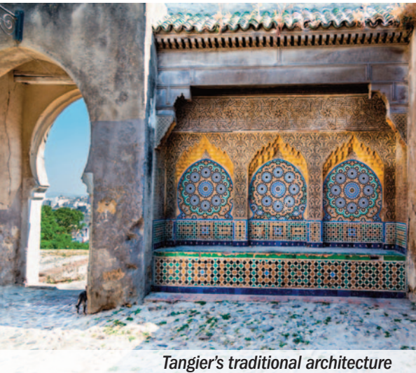
Tangier's traditional architecture

NOT INCLUDED: International airfare; travel insurance; expenses of a personal nature; any items not mentioned in the itinerary or the above inclusions.