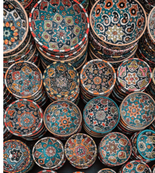
Colorful pottery at a bazaar

industry, and culture. We will explore several of Oran's highlights, including the 17th-century Fort Santa Cruz that overlooks the city and the Sidi El Houari district. We will also visit the Medina Jedida, a massive market selling flowers, textiles, jewelry, and souvenirs of every description. Here we will have the opportunity to sample Algerian street food, including kerentica, a cake made with chickpea flower and eggs that is a specialty of Oran. (B,L,D)