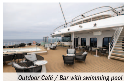
Outdoor Café / Bar with swimming pool

Currently under construction in Finland and launching in early March 2023, Swan Hellenic's Diana is a new-generation expedition cruise ship. Although at 12,100 tons the ship is large enough to accommodate more than 350 passengers, Diana will accommodate a maximum of 192 guests in 96 spacious staterooms and balcony suites. The low guest density results in one of the most generous indoor and outdoor space-to-guest ratios among cruise ships.