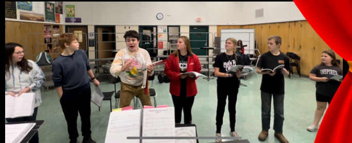
SOME OF THE PRIMARY STORYTELLERS OF MARY POPPINS DURING A RECENT STAGING REHEARSAL

TICKETS FOR THE MIDDLE SCHOOL MUSICAL, MARY POPPINS JR. ARE LIVE TODAY! CLICK HERE TO VISIT THE TICKET SALES DIGITAL BOX OFFICE. ALL TICKETS ARE GENERAL ADMISSION (FIRST COME, FIRST SERVE SEATING). TICKETS WILL ALSO BE AVAILABLE FOR PURCHASE AT THE DOOR. THIS IS A SHOW YOU WON'T WANT TO MISS!