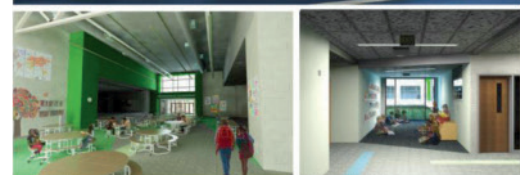
Architectural examples for new elementary building