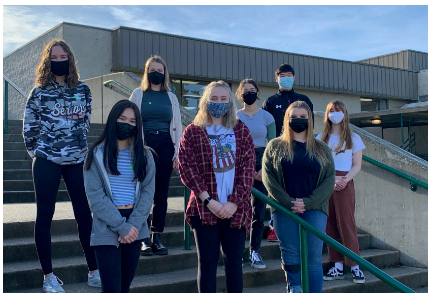
Rotary Interact Club Students

Requested items include washcloths, Q-Tips, athlete's foot cream, baby wipes, hand warmers, and band-aids. Donated items will be given to help community members in need. Items can be dropped off at PAHS, Lincoln Center and the newly remodeled Shore Aquatic Center!