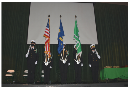
NJROTC Cadets Presenting the Colors