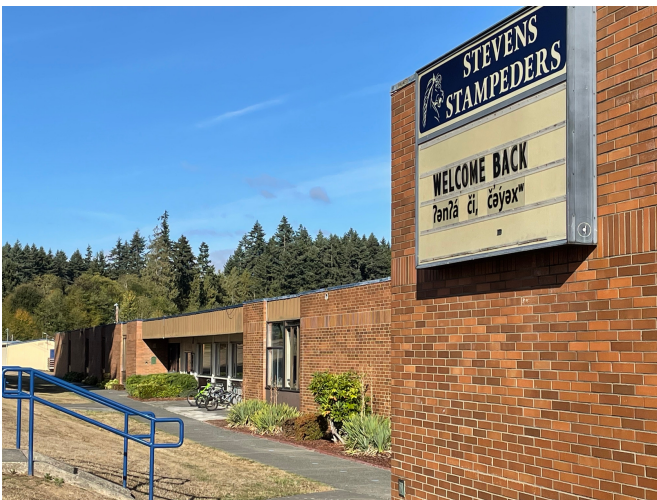
Pictured above: Klallam welcome message on the reader board sign at Stevens.

All schools with readerboards like the one at Stevens Middle School, which is every school except for Jefferson, have a set of welcome and congratulations messages to display. Other messages include: