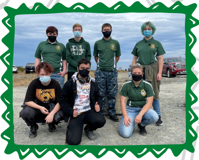
Pictured Left to Right:

NJROTC Cadets volunteered their Saturday at Nor'Wester Rotary's Jammin' in the Park concert on 9/4/21. Cadets helped bands move equipment and managed parking. Funds raised from this event go to local high school scholarships. Thank you, Cadets!