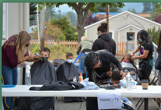
Beauticians hard at work getting students ready for the first day of school!

Thank you to everyone who had a part in making this day special for our families and getting students started on the right foot with the supplies and support they need to succeed!