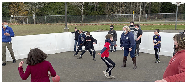
Dry Creek Gaga Ball Pit