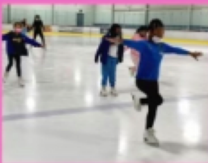
Grades 1st -12th

Field Trips, Tutoring, Coding, STEAM workshops, Go Fit Exercise, Leadership, and more!