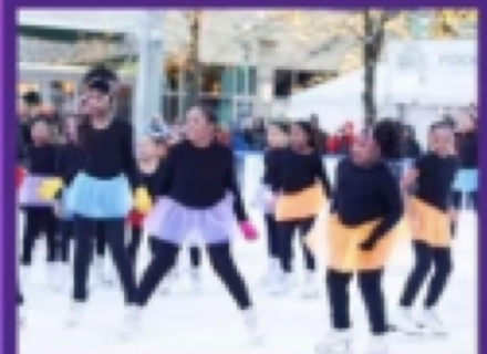
Girls of Color