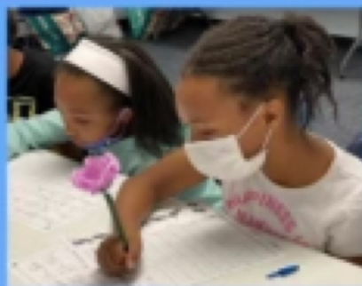
Classes run from October - May