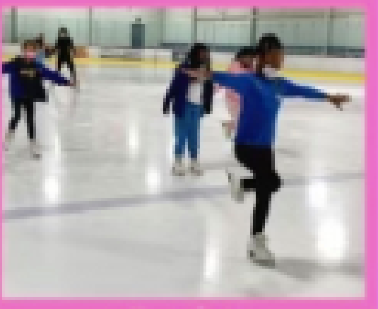
Grades 1st -12th

Field Trips, Tutoring, Coding, STEAM workshops, Go Fit Exercise, Leadership, and more!