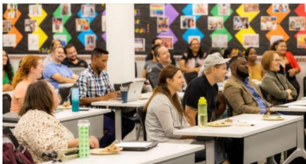
THE BEACON MEDIA Kansas City Public Schools working to ramp up parent input KCPS plans to start a parent organization at each school in an effort to include more voices on...