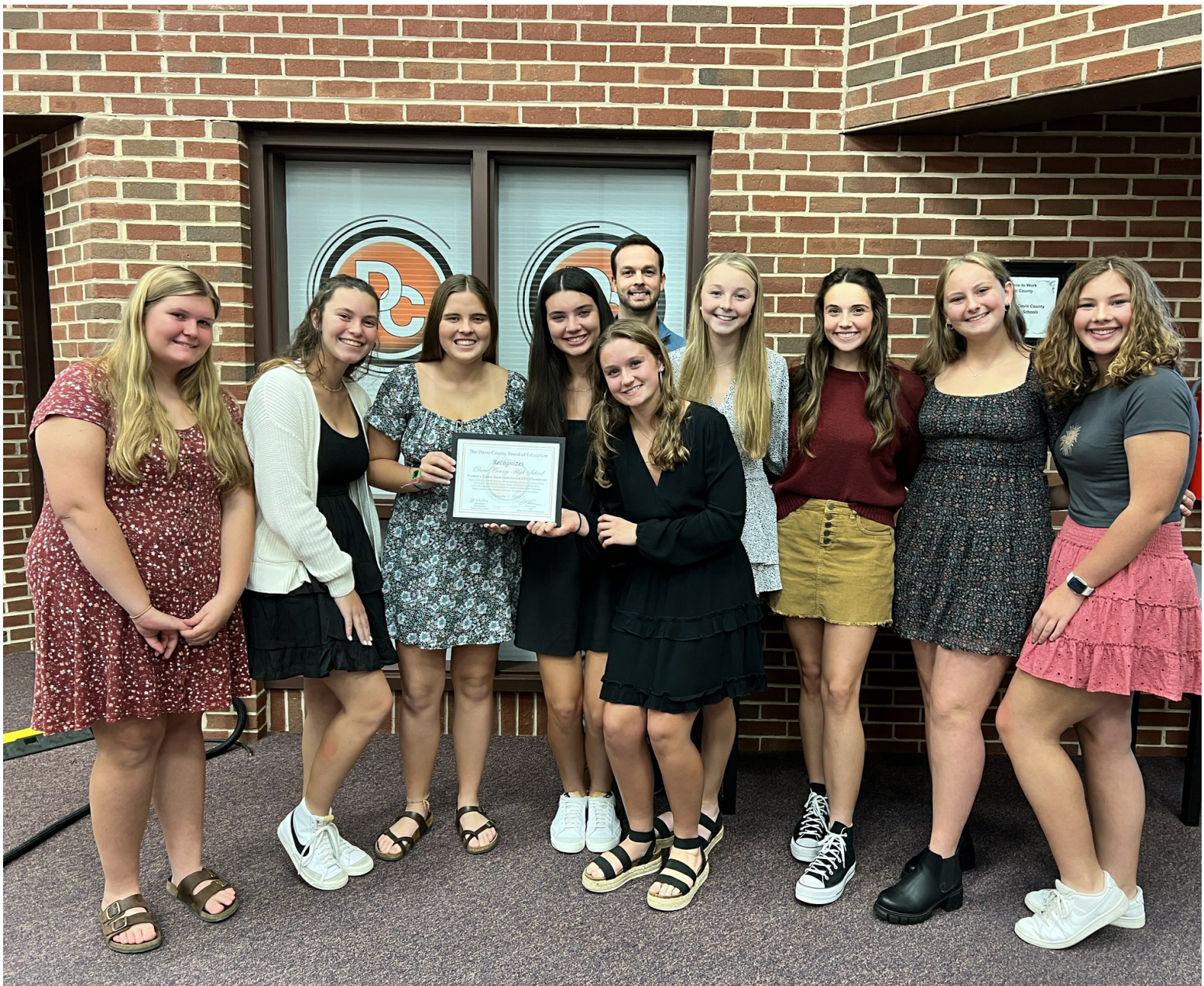
Davie County High School Women's Tennis Team Conference Champs!