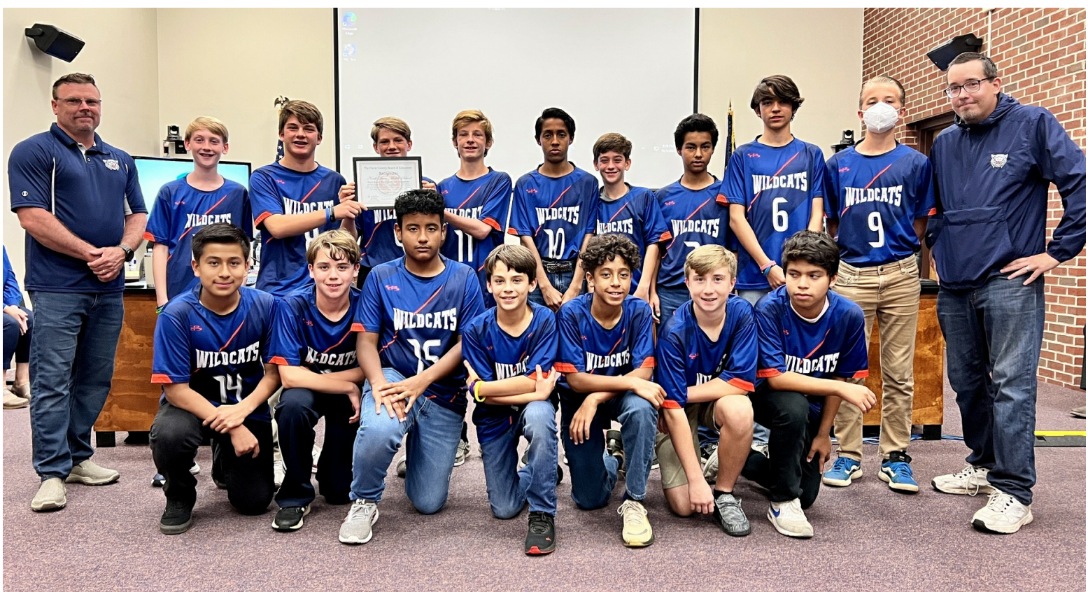
North Davie Middle School Soccer Team Conference Champs!