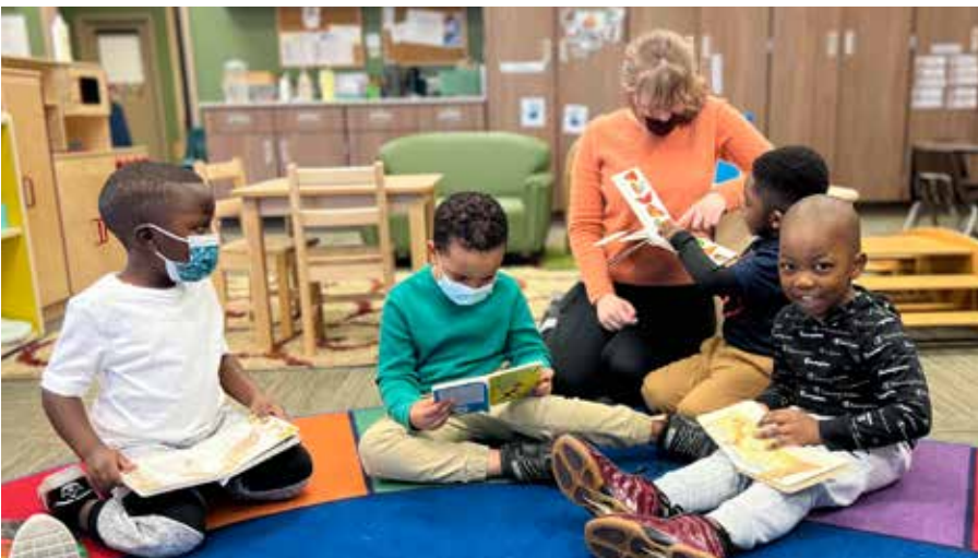
Independence - Cooperation - Relationships - Play