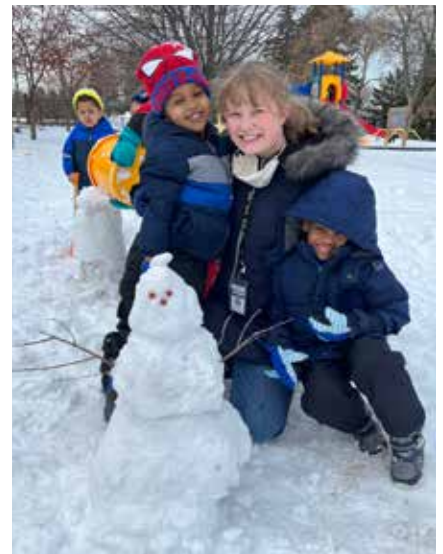
Routines Social Skills Listening Learning