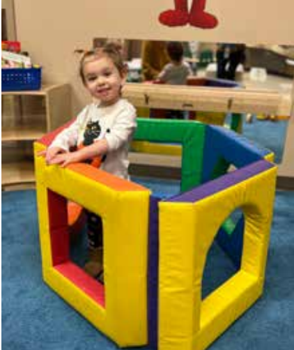
Circle & Gym Time - Outdoor Classroom - Building